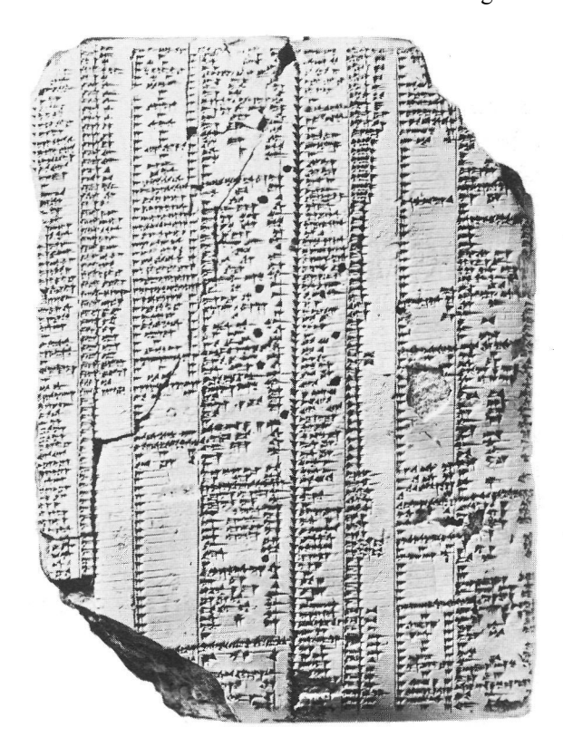
Ancient dictionary on clay tablet

a permanent central staff." Hence, what the Oriental Institute undertook to do was to produce a dictionary that would provide access to the vocabulary of the great body of the material and to the several dialects of the Akkadian language, so that the designation "Assyrian Dictionary" is maintained only for tradition's sake. The range of cuneiform studies expanded greatly while the Dictionary was in progress; it ranges now from the Old Akkadian texts of the late third millennium to those of the Late Babylonian period dating from the first century of our era and comprises dialects spoken in areas outside Babylonia and Assyria proper, such as Susa, the region to the east of the Tigris, Mari, Syria, and Asia Minor. Due consideration is being given to the Sumerian background, to the information contained in Hittite and Old Persian cuneiform texts, to the use of foreign words within the Akkadian vocabulary, as well as to the spread of Akkadian and Sumerian words into other languages.