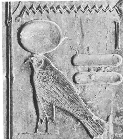
Sculptured hieroglyphs in tomb of Kheruef in Egypt

Begun in 1924, the Epigraphic Survey expedition to Egypt is the oldest of the Institute's field enterprises. It was initiated to help relieve a situation distressing in two particulars. The first was that so many of the great monuments of pharaonic Egypt had never been accurately drawn, rendered, and reproduced in print for scholarly study. The second was that the vast body of reliefs and inscriptions with which the walls of the structures are covered was deteriorating visibly from year to year, after so many centuries of exposure, a great part without having ever been copied systematically and with full attention to accuracy of detail.