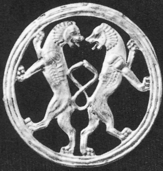
Achaemenid gold medallion

Printing and publishing are normally handled for the Institute by the University of Chicago Press. A comprehensive catalogue of the Institute's publications is available upon request. It lists the publications in the following series: