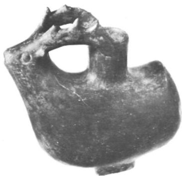
Zöomorphic red pottery jar from Mazanderan region, northern Iran