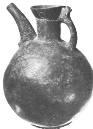
Pottery vessel from Mazanderan region of northern Iran, about 1000-700 B.C.