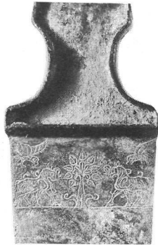
Detail of engraving on dagger