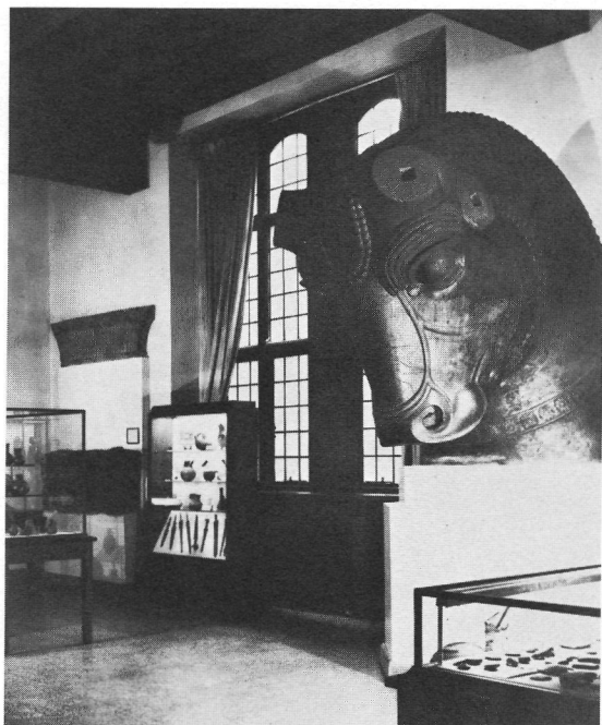
The Iranian Hall of the Oriental Institute

In the meantime new perspectives have opened up on the distant past, and new methods for its appraisal have been developed. The historical questions we seek to answer require the judgment of humanist, social historian, and