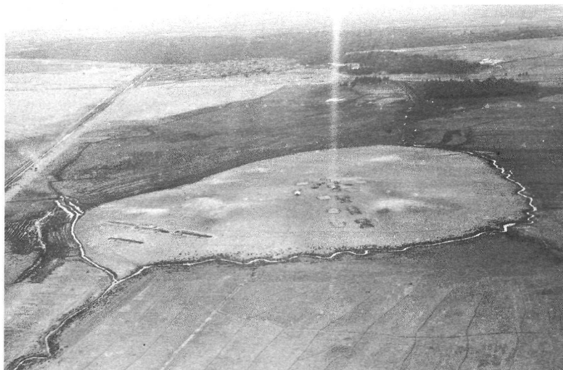
Tepe Sohz, looking southwest, with the beginnings of our trenches in the center. In the background are the village and plantations of Mansuriya.

We cleared mainly the surface and upper levels of a long strip which will eventually become the step trench, and on the whole we confirmed those features which we had learned something about from the previous soundings. The most important results were that we were able to confirm the existence of the central terrace, to locate its outer edge, and to determine that it was built of mud brick. All other plans, for example, opening larger areas in order to find complete building units, had to be left for the next season, which is scheduled for January, 1972. Since I have accepted an appointment at the Free University of West Berlin, the expedition will become a joint effort of the German Research Foundation, the Oriental Institute, and the Free University of West Berlin.