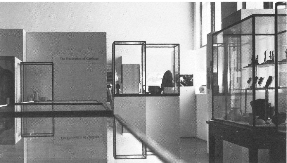
General views of the Palestinian Gallery, looking west and east

It is hardly an exaggeration to say that we could have done little more than maintain the status quo if we had not received outside funds. For the second year running we received a grant of $15,000 from the Institute of Museum Services of the Department of Health, Education, and Welfare. In this highly competitive field, we were one of the 403 successful museums among the 1,714 who applied. The special advantage of this Federal grant is that it can be used for