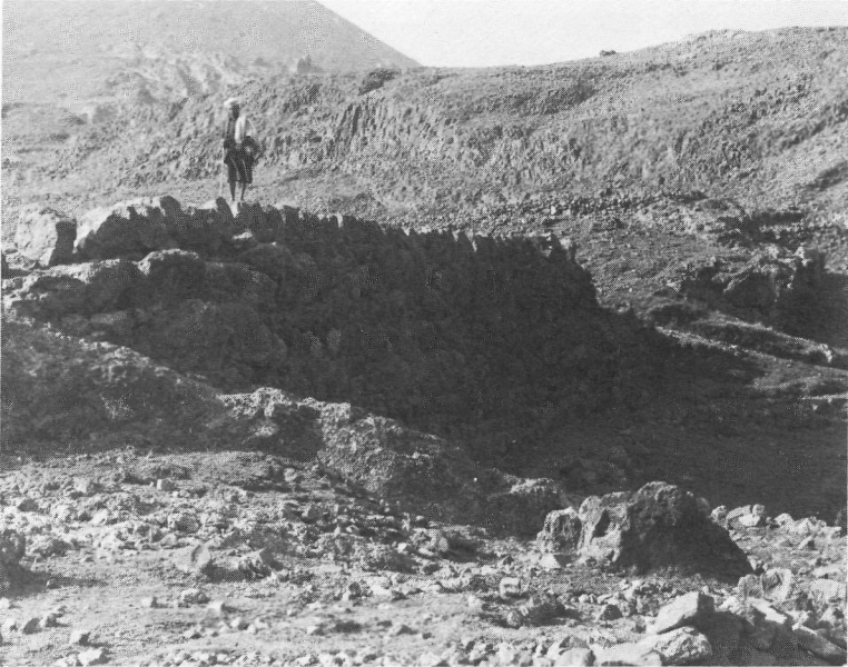
Remains of a Himyarite dam near Zafar, from the downstream side

building rubble and occasional foundation and retaining walls. A proper understanding of this area will have to await clearing of the rubble and delineation of the foundations.