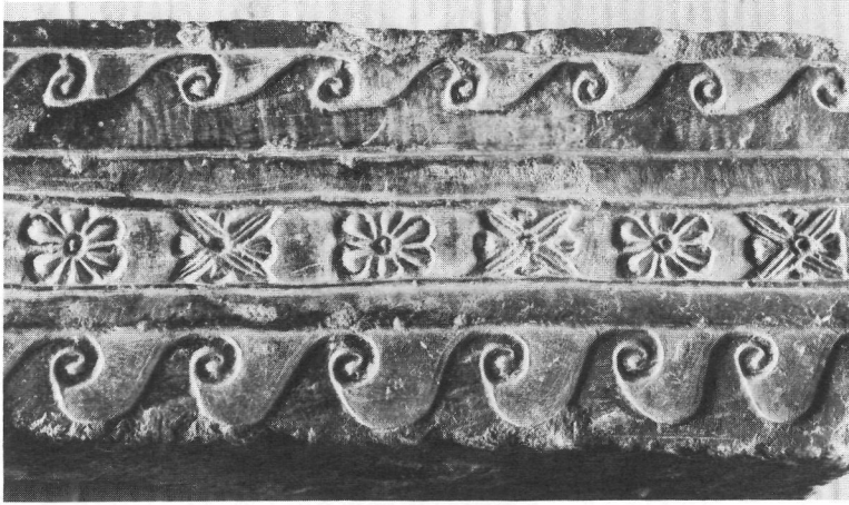
ZM 765: architectural element with pattern of wavelets and rosettes in relief

pre-Islamic South Arabian civilization, Zafar fell into decay and the stones from its palaces were carried away to build surrounding towns and villages; today its ruins share their mountaintop with a modern village and a small museum. This year there were three priorities: to continue work on the Zafar Museum collection, to finish mapping ancient features on the site, and to extend the survey to the surrounding area.