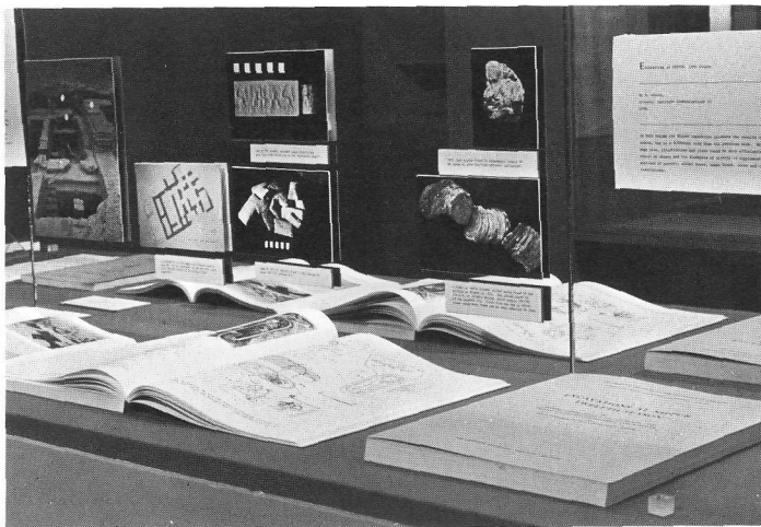
Archaeological Investigations, Publishing The Past