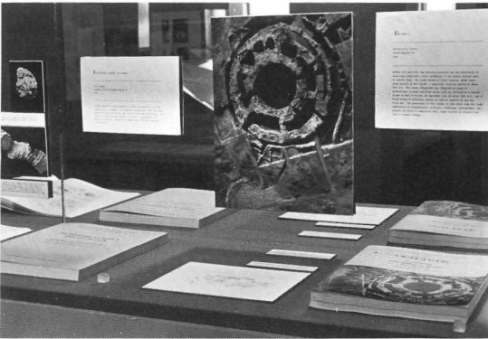
Archaeological Investigations, Publishing The Past