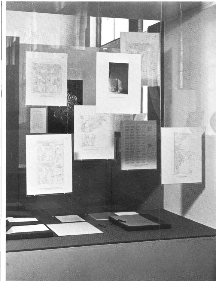
Ancient Egypt, Publishing The Past