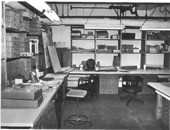
The new basement work space.