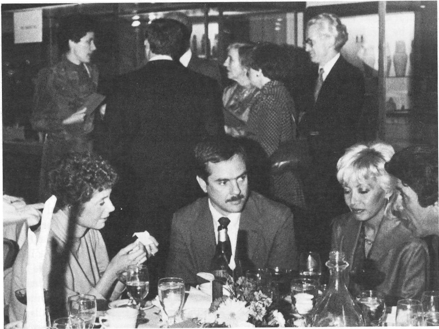
Annual dinner in the Museum (May, 1984).