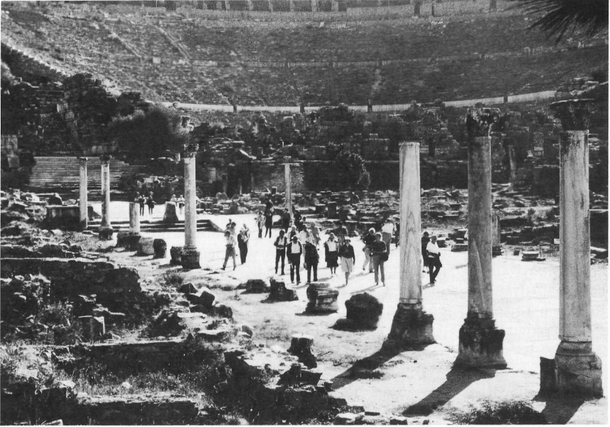
Turkish tour in the ruins at Ephesus.