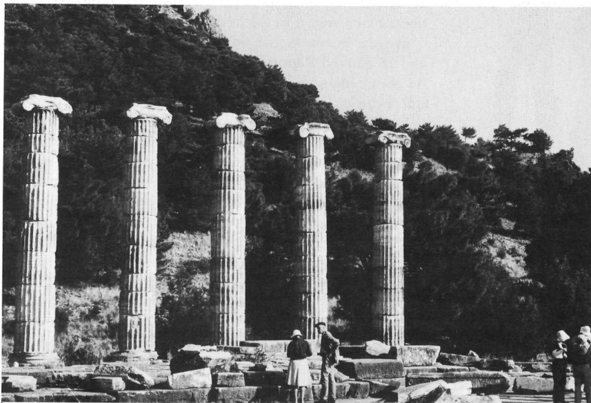
Turkish tour at the site of Priene.