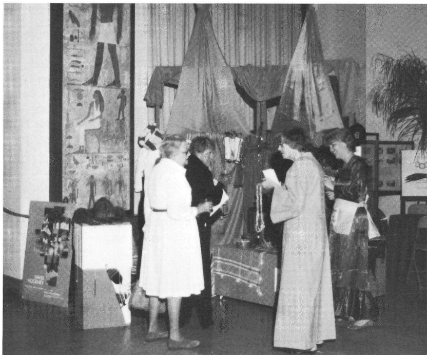
At the Chicago House benefit in October the Suq expanded to include several "little Suqs " scattered through the Museum.

feel our more active role in publicizing the Institute and the Suq , including Suq offerings in our own News & Notes , as well as the publicity we received in the Chicago Tribune , were a contributing factor to our increased sales. Also, for the first time I attended the American Craft Fair in Valley Forge, Pennsylvania, where I found several new vendors with extremely well-made wares (using ancient techniques) to add to our collection. We also col-