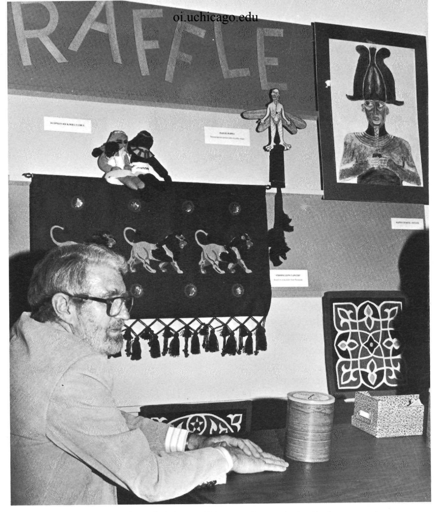
A selection of craft projects from the Museum Education Program's Art Projects manual was displayed and raffled at the annual dinner in May for the Volunteer and Education programs.

collating lists, addressing, and then collating returns, as well as on decorating, on selling in the little Suqs, and on running the silent auction. The success of the benefit was celebrated at a special party for volunteers.