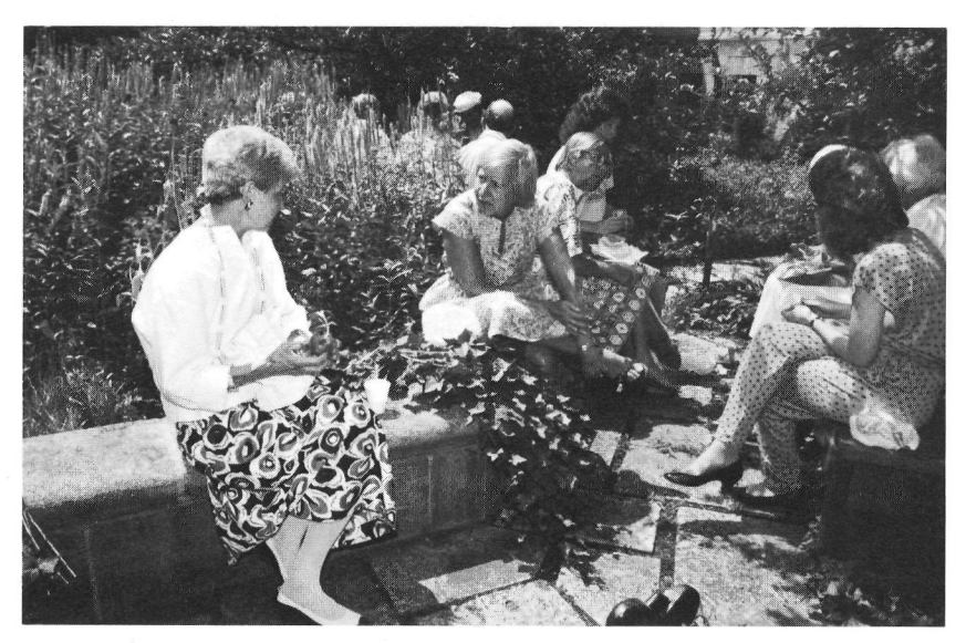
Picnic lunch in the garden at a spring Docent Day.

Training courses for new docents ran on both Saturdays and Mondays this year and afforded us a large class