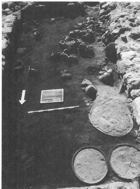
Figure 1. Ancient bakery A7d with cache of bread molds and three vats in the northwestern corner

It was very insightful to see the full complement of vats and bread pots laid out along the low walls or set within the space of the bakery. The low walls all around must have served as “counterspace” for keeping the empty pots and finished bread. Ed Wood’s requirements for sourdough gave rise to other insights. It was clear, for example, that we needed separate containers for water, flour, and ferment (fig. 1)—perhaps the reason for the three vats in the northwestern corner (fig. 2). A separate vat, of which there was evidence along the western wall of one of our bakeries, was probably for mixing these ingredients. Even the design deficiencies of our bread pots provided insights, for example, the sharp inflections of the exterior walls of the pots are important for the ancient practice