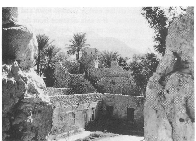
Interior view of Agaba castle

1. The early Islamic town of Ayla, severely damaged by the earthquake of 1068, was not restored. With the arrival of the Crusaders in 1116, the inhabitants decided to