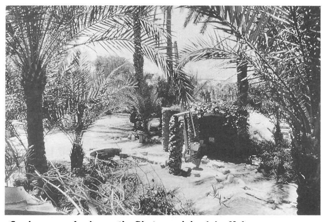
Gardens near Aqaba castle.

3. The next stage saw the growth of a village around the fort, embellished and expanded by the Mamluks. At the same time, memory of