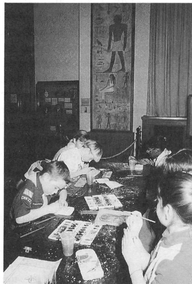
After seeing ancient reliefs in the Museum's Egyptian Gallery, children carve and paint their own versions during one of the free Sunday Family Programs supported by the Elizabeth Morse Charitable Trust.

Informal adult education opportunities were also available throughout the year. A special series of free, drop-in events on Wednesday evenings began in Septem-