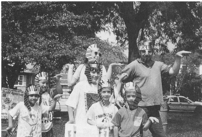
King Tut comes alive in Marquette Park! Children and their families made ancient-style headdresses and "walked like Egyptians" when the Oriental Institute joined the Chicago Park District's "Parks Partners" summer program to offer free hands-on activities in the city's parks.

The Elizabeth Morse Genius Trust has provided us with generous new support. Early in 1995 the trust awarded the Museum Education Office a planning grant to explore possibilities for outreach programming at other sites when the Museum closes for