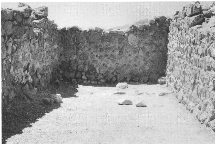
Room (near tower), at Khirbet Qumran, that once supported a second story claimed by traditional Qumranologists to have served in antiquity as a “scriptorium”