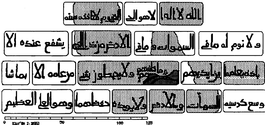
Figure 5. Reconstruction of the Ayat al-Kursi inscription from the Egyptian Gate area. The inscribed stone found this year is the large stone in the lower center

One of the additional projects undertaken this season involved providing assistance to the Department of Antiquities in restoring the Egyptian gateway, which entailed finishing the excavations by “opening” the gate and restoring the original arches and vaulting. Fortunately, the Aqaba inspectorate has assembled a talented and experienced restoration team for such projects. Among the rubble filling the gate was a missing piece of the Ayat al-Kursi inscription ( Qurʿan 2: 255). Other fragments of this monumental inscription, carved in limestone, were found tumbled in the debris in front of the Egyptian Gate (fig. 5). The block found this year includes the phrase which reads “ wa ma khalfahum wa la yuhituna bishay ” (and what is behind them, and they comprehend nothing ...). This block adds important evidence for the history of the city and for Arabic paleography. The original inscription would date to the Umayyad period, soon after foundation of Ayla. However, inconsistencies in letter formation indicate recarving of some of the stones, presumably in the Abbasid period. The new stone shows a surface fracture, probably resulting from wall movement during the 748 earthquake. The first word has been recarved using a slightly different monumental script and illustrates calligraphic changes in the early Abbasid period. Clearly, detailed study of this inscription is warranted in future seasons.