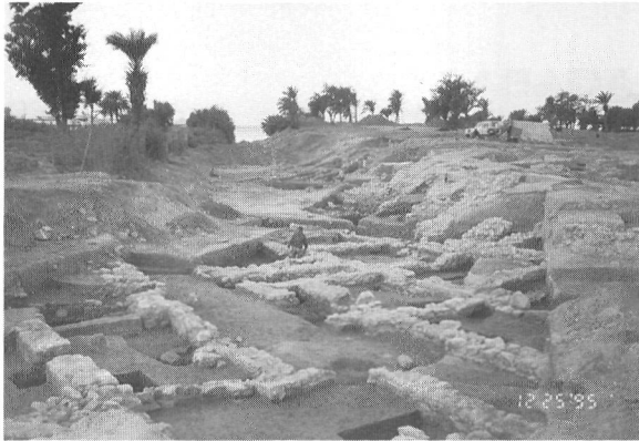
Figure 2. A general view of the street and buildings excavated in the wadi bed, looking southwest toward the beach. John Meloy stands in the distance (middle)

Archaeological research brought to light the early Islamic city, founded during the early caliphate of ‘Uthmān ibn ‘Affān. This town was occupied from about A.D. 650 to the arrival of the Crusaders after A.D. 1100. The site is now being developed into a tourist attraction, giving a historical depth to the modern port, Jordan’s window to the south