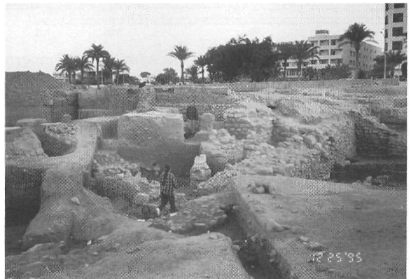
Figure 4. A general view of the large structure between the mosque and the Central Pavilion, looking north. Ghida el-Osman and Ansam Melkawi discuss the final recording of this area

The interpretation of the architecture to the south (and under) the Abbasid mosque is very uncertain. The first suggestion was that this building might be the dar al-imara of the early Islamic town. Architectural details, such as a doorway beneath the Abbasid mihrab and walls extending beneath the qibla wall, indicate that the earlier mosque (if beneath the Abbasid mosque) must have been much smaller than assumed. On the other hand, evidence has accumulated to suggest that the Umayyad mosque must be located elsewhere in the town. Thus the large and important buildings discovered this season might not be associated with the dar al-imara , though official or administrative functions are certainly possible. The complexities of urban architecture revealed in the Ayla excavations emphasize the general lack of archaeological evidence for the process of urbanization in early Islamic cities. The data recovered from Ayla is an important step toward the delineation of this history.