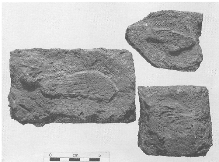
Figure 3. Fish remains from floor along low benches in excavation Square F19

about the same elevation as though the site had been carefully leveled when it was abandoned. There is very little debris or mounding such as would be produced by a gradual collapse of the walls. The stratified occupation deposits extend about another meter below the phase of the bakeries and mudbrick building.