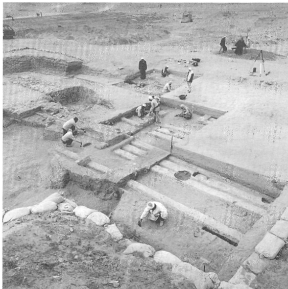
Figure 1. The 1995 excavations in Area A7 with Squares G20 (foreground), F19, and E18. View to the southwest

Eidgenössische Technische Hochschule in Zurich. Larger samples were dated at the Institute for the Study of Earth and Man, Southern Methodist University, by benzene scintillation (the latter facility has since moved to the Desert Research Institute in Nevada). The results were published in Chronologies in the Near East (O. Aurenche, J. Evin, and F. Hours, eds.; BAR International Series 379; 1987; pp. 585–606). The dates, after dendrochronological calibration, averaged 374 years too early for the Cambridge Ancient History dates of the kings with whom the pyramids are identified.