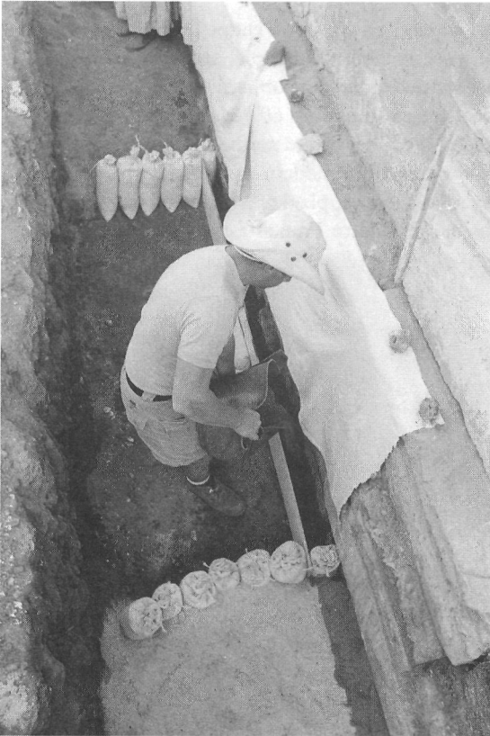
Figure 5. After photography of the subterranean foundation courses, Dany Roy supervises the reburial of the trenches, packing sifted soil next to the foundations and filling the remainder of the space with clean sand

During the reclearance of the interior trench of the northern wall, the workmen made an unexpected discovery, to our great astonishment: the statuette of a priestly official, lying in pure sand below the threshold of the northern doorway and just within the Ptolemaic hall itself (fig. 3). To judge from earlier excavation records, Hölscher's clearance of the hall had, in general, descended to a depth of well over a meter; but the area of the northern doorway had apparently been avoided, perhaps because it was needed as a point of egress for the dumping of excavated debris. Whatever the reason, it is clear that the statuette had been deposited in the original sand bedding for the foundations of the Ptolemaic hall, presumably after it had been