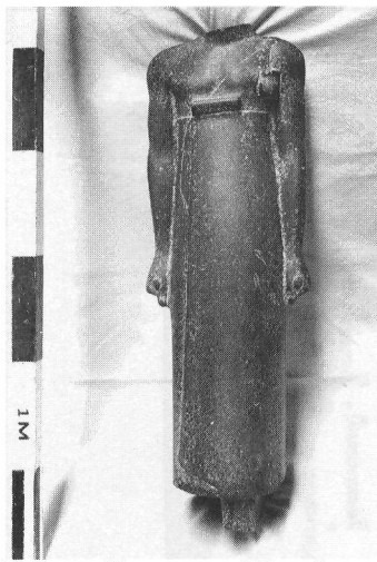
Figure 3. The statue of Tjanefer, a priestly official of western Thebes, found in one of the foundation trenches of the Ptolemaic hall

fragments behind Luxor Temple and to review conservation procedures with our new fragment Hiroko Kariya, who then undertook the tasks of consolidation, desalinization, and documentation for the next three months on-site. The treatments of the stone fragments included successive applications of the consolidant Wacker OH, which has been shown to be remarkably effective over the last ten years on our fragments, as well as tests using other types of consolidants. Several methods of application were attempted, the most common being the painstaking procedure of drip-feeding from a glass pipette, occasionally enhanced by pre-wetting the surface with ethanol to facilitate absorption. Wacker OH and other substances must be used under restricted ranges of temperature and humidity, and Hiroko was able to control these atmospheric limits to a certain degree under makeshift shelters erected in the blockyard. Dr. François Larché, director of the Centre Franco-Égyptien pour l'Étude des Temples de Karnak, kindly made supplies of Wacker OH available to us;