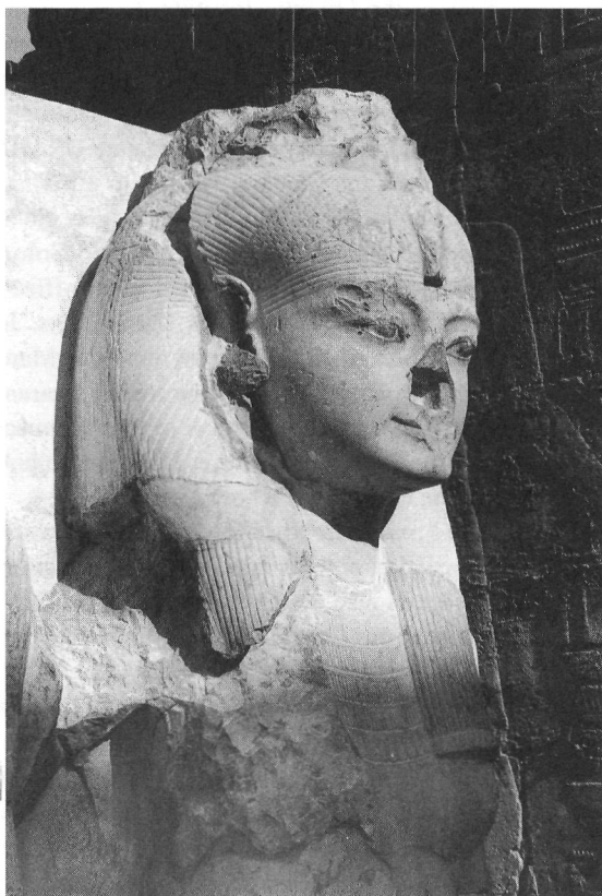
Figure 7. A shaft of sunlight and a serene smile warm the face of Mut, reunited with her divine consort, Amun, in the large dyad of the Colonnade Hall in Luxor Temple