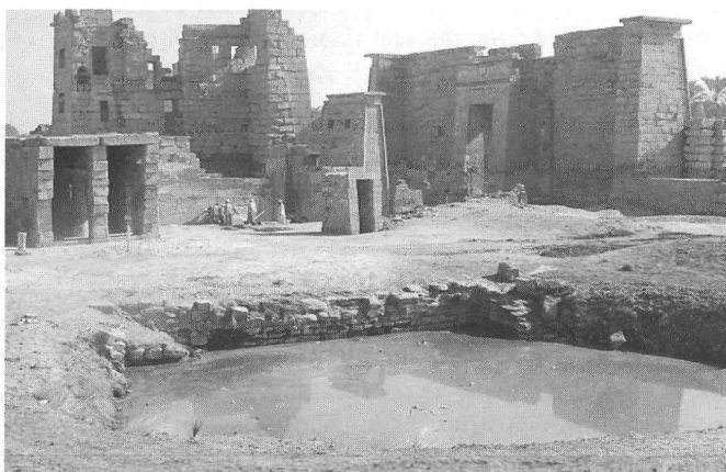
Figure 1. General view, from the northwest, of the small temple of Amun at Medinet Habu and its sacred lake; the eastern High Gate looms behind

As always, the collation of drawings and consultations with the artists formed the major tasks for the epigraphers this year, who concentrated largely on the interior painted chapels at the temple of Amun, decorated jointly by Hatshepsut and Tuthmosis III. In the course of six months at Medinet Habu, epigraphers John and