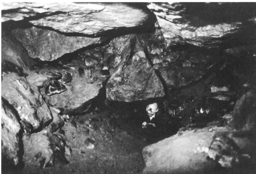
Team member at work in Kestel Mine

near the mine as well as on Göltepe hill. One such crucible was analyzed at the Conservation Analytical Laboratory of the Smithsonian Institution in 1992 and found to have a tin-rich interior surface, similar to the ones found at Göltepe. It is possible that the crucibles at Kestel could have been used to assay the ore for tin content in order to make strategic decisions during mining.