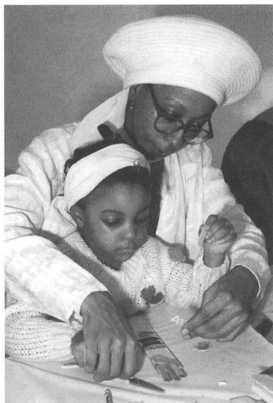
Figure 4. A mother and daughter make ancient-Egyptian-style clappers at "Awesome African Arts" an Oriental Institute/Smart Museum family festival that was held in conjunction with African American History Month.