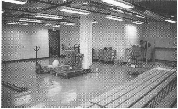
New book stacks room in Research Archives with shelving in boxes.

It is, of course, through the generosity of donors to the Legacy Campaign that all of this has come to pass. In honor of the generous support of the Elizabeth Morse and Elizabeth Morse Genius Charitable Trusts, the Reading Room of the Research Archives will be named The Elizabeth Morse Genius Reading Room and recognized with a sign and plaque. We continue to work towards completing the challenge grant generously offered by the Elizabeth Morse and Elizabeth Morse Genius Charitable Trusts that will allow us to restore the lighting in the Reading Room and provide electrical and network wiring access to each of the tables.