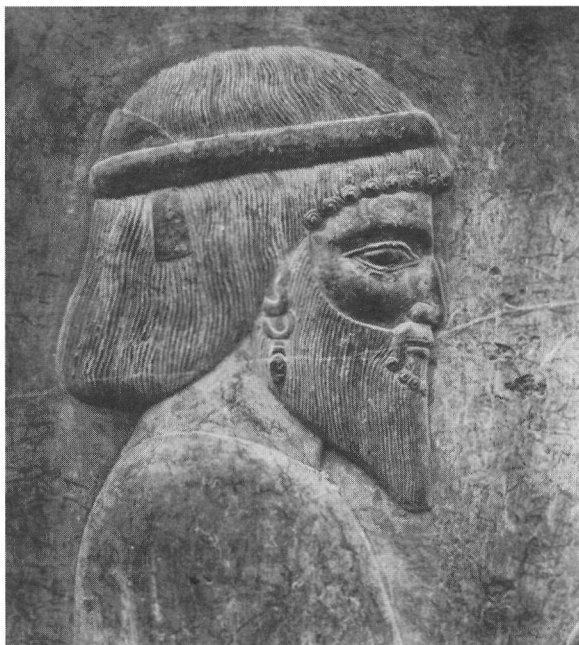
Detail of Bactrian tribute bearer. East stairway, Apadana, Persepolis

When the program was first written during summer 1997, I converted all of the data from the Epigraphic Survey's existing computer database into the new database structure through the use of several conversion programs that I wrote. Unfortunately, many hours of manual labor still lie ahead for the Epigraphic Survey staff in order to take full advantage of the new program's relational database capabilities because of the different file structures in the old and new programs. Some of this work can be automated through the writing of additional conversion programs, but some will require hours of retyping data. I hope to report on how this process is proceeding in next year's Annual Report .