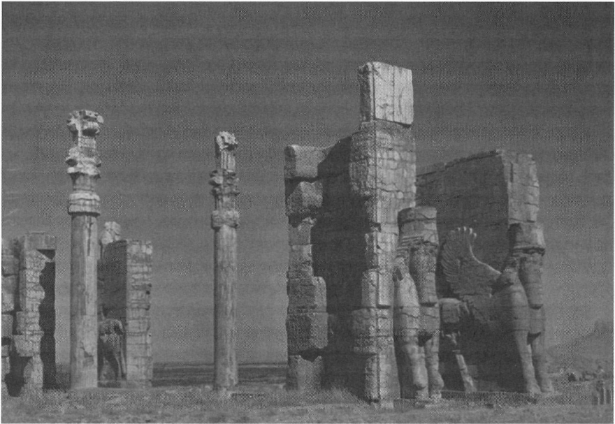
Guardian man-bulls of east doorway. Gate of Xerxes, Persepolis