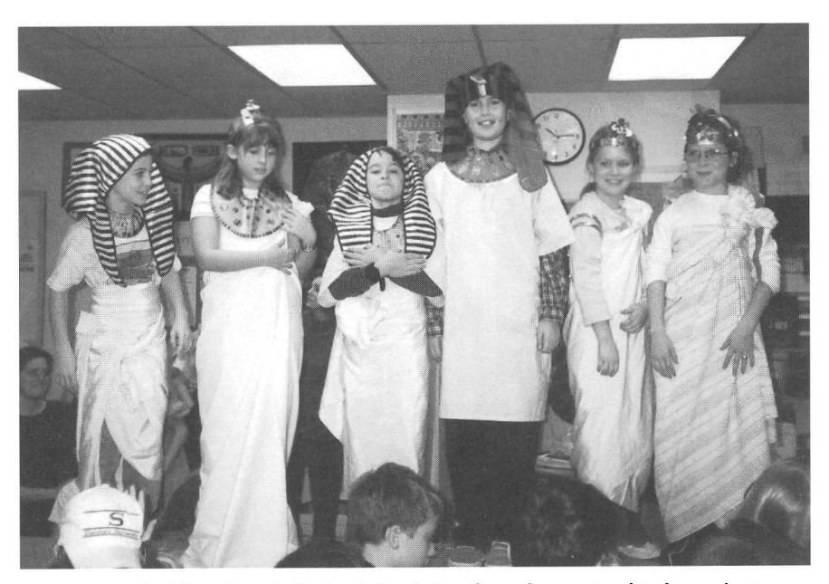
At an outreach visit to Francis Parker School, fourth graders pretend to be ancient pharaohs and princesses.