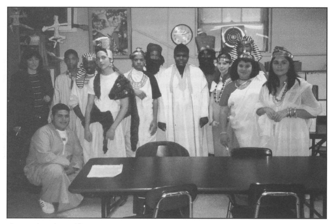
These students from Abbott Middle School in Waukegan, Illinois, were part of a group who participated in ancient Egyptian and Mesopotamian fashion show.