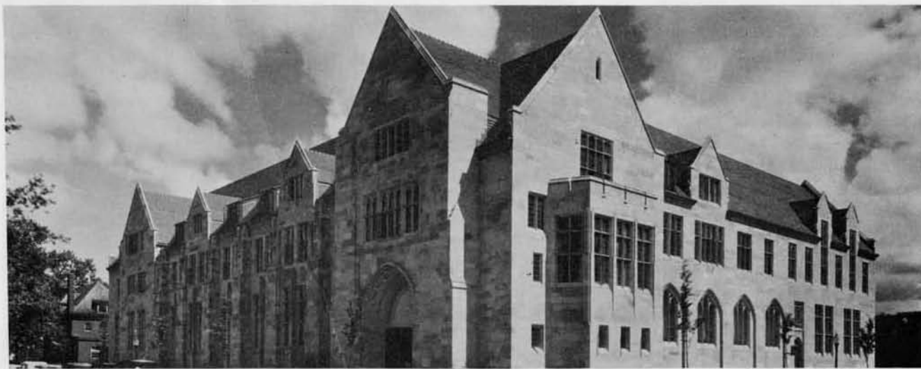
The Institute Building soon after it was built