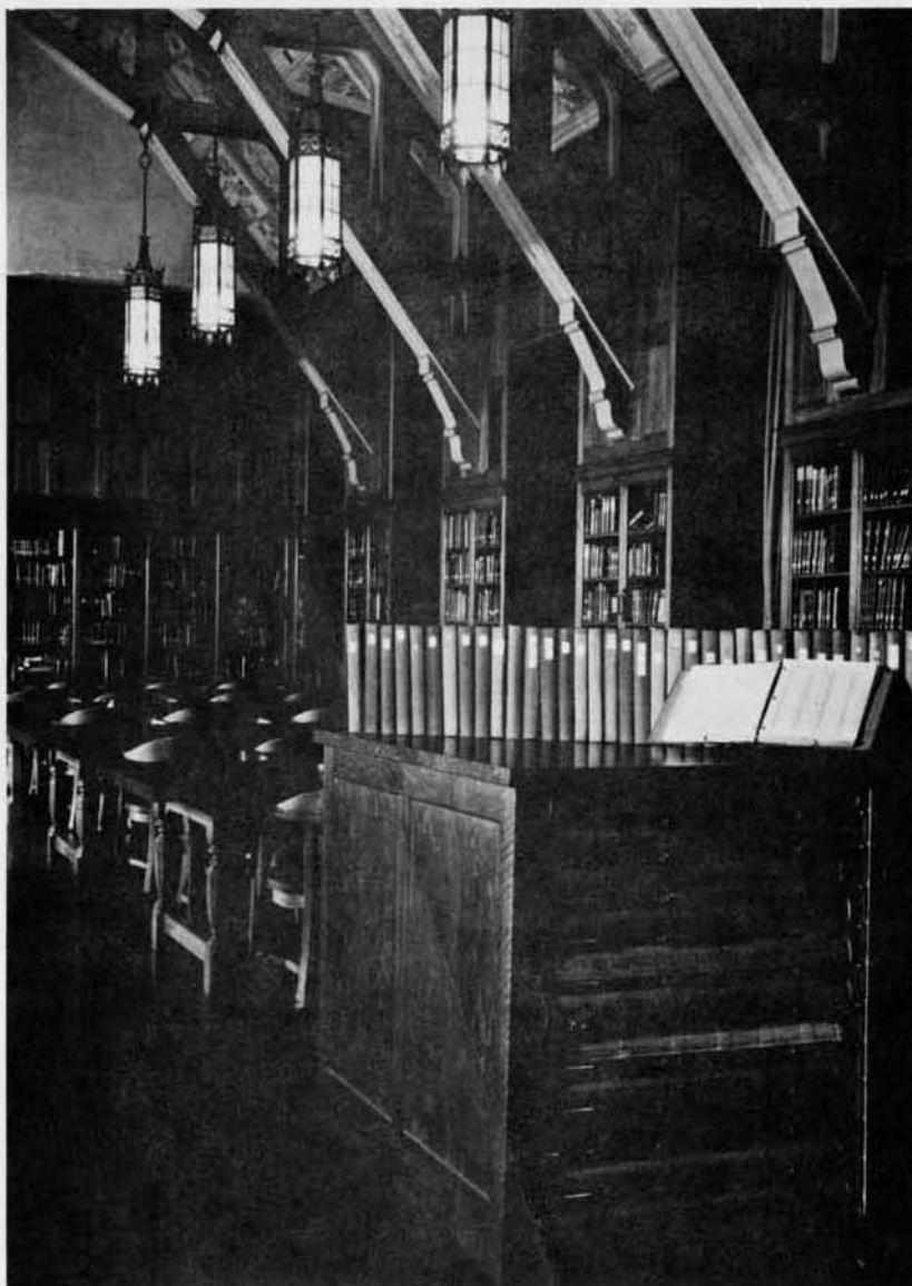
The Oriental Institute Library, 1932

ture of their countries. JEA and IEJ deal strictly with the ancient phases of these countries, while the other journals occasionally print articles stretching into medieval or sometimes almost modern times. The Palestine Exploration Quarterly ( PEQ ) includes Israel, Jordan, Syria, and Lebanon; the Bulletin of the American Schools of Oriental Research ( BASOR ) adds Mesopotamia to these regions, but is restricted to ancient times. The American Journal of Archaeology ( AJA ) emphasizes the Classical world, but sometimes publishes articles on the Near East. Finally, the Journal of Near Eastern Studies ( JNES ), published by the Department of Near Eastern Languages and Civilizations of the University of Chicago, covers all aspects of the history and culture of the Near East, ancient and modern, and includes many shorter reviews. It is probably the most useful journal to recommend to the Institute member interested in following closely the work of the Oriental Institute.