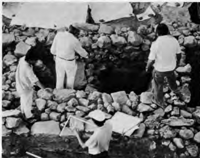
Consultation over how next to proceed in clearance of the skull building's smaller back rooms. In full background, the apse-like loop of wall; in the foreground, Murat draws the cattle-horn cluster.

Some human skulls and long bones did continue to appear, but the building's surprise this season was a cluster of wild cattle horns, centered against the rear wall of the large front room of the "skull building." The cluster lay in a depression in the plastered floor, deeper than the floors we'd exposed in our earlier season's work. For some time now it has been known that—a thousand years or more later—the bukranium motif (the head and horns of cattle) had some very special meaning for the people living in the plateau-piedmont regions of the upper Tigris-Euphrates drainage area and beyond. Now, here at Çayönü, before 7,000 B.C., we find the bukranium symbol in a building clearly dedicated to some special purpose. This adds to our fascination concerning what the building's purpose Continued on page 4