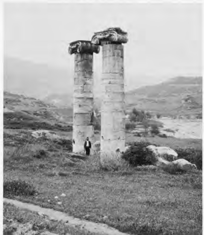
Two columns supposed to belong to the "Temple of Cybele," at Sardis: O.I. archives, A.T. Olmstead, 1902.

This exhibition is supported by a major grant from the National Endowment for the Humanities.