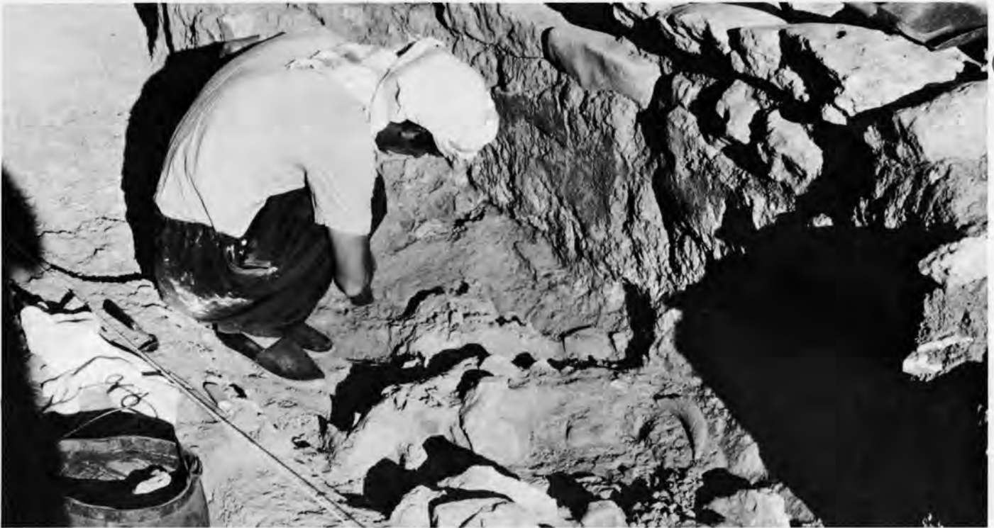
Murat clearing the cattle-horn cluster in the skull building.