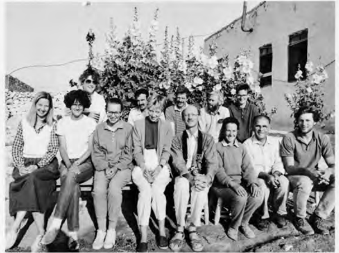
Joint staffs from Oriental Institute and Australia (Australian National University and University of Melbourne), before reinforcements arrived from Chicago.

1985 Ebla to Damascus . Washington: Smithsonian.