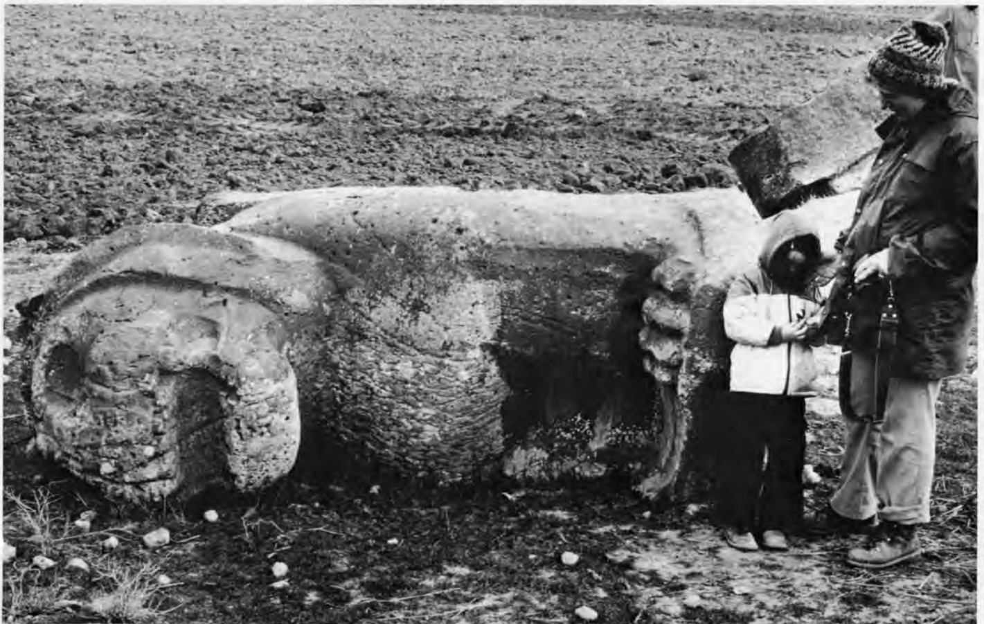
Fallen basalt lion from the lower city at Tell Ahmar (Til Barsib).