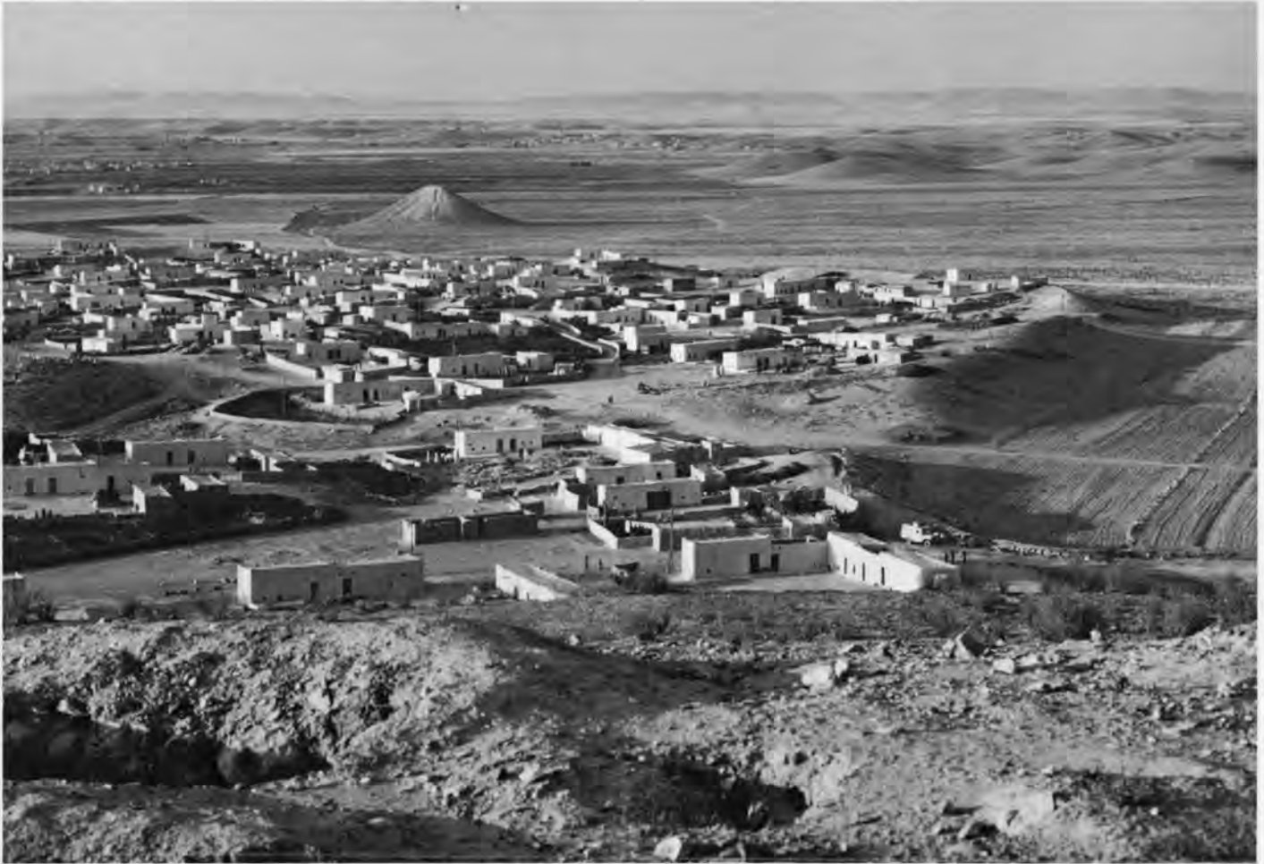
Looking north from Tell Bazey. Background: small conical mound of Tell Banat; foreground: village of Tell Banat and ancient rampart on its east (right) side.

We asked if he knew of any other ancient sites. He said yes, and pointed back to the village from which we had just driven, and told of old ovens there. I wasn't very interested late in the day in seeing ovens probably abandoned by the villagers twenty years ago, but we dutifully drove back into the village, crossing a rather steep rise and the paved road behind it. We stopped about 30 meters from the crowd of men whom we had left minutes earlier. We couldn't immediately find the elusive ovens until an old woman came out of her house (we were in her 'front yard') and pointed toward our tire tracks. We had driven over the outline of an oval oven, much larger than I had expected. Nearby was a second but we couldn't find any sherds to date them. We drove on through the village to the foot of the mountain, Tell Bazey, for a quick look at it and found along its slopes large stone walls that are remains of terraces and defenses—and alas, lots of recent robber pits with pottery strewn everywhere. This fortified mountain, its protruding walls, and some of its sherds are all strikingly similar to our fortress at el-Qitar.