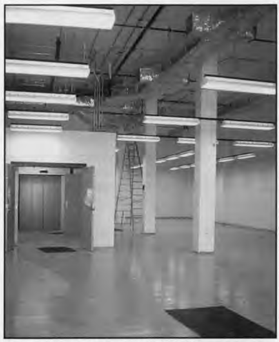
Figure 2. The first floor of the addition, which will house archival and organic object storage. The freight elevator that connects all floors of the new wing is visible through the doorway on the left

be maintaining the stable temperatures and relative humidities that were the governing force behind this project. Then museum staff will begin the daunting task of moving the collections into the new wing and renovated portions of the basement of the original building. In the space of one month, we will need to move 4,520 temporary storage boxes and crates, almost 1,900 drawers of pot sherds, 4,800 objects out of the former organic storage room, and 108 drawers of metal objects into their new homes, while still keeping track of each and every one's final location.