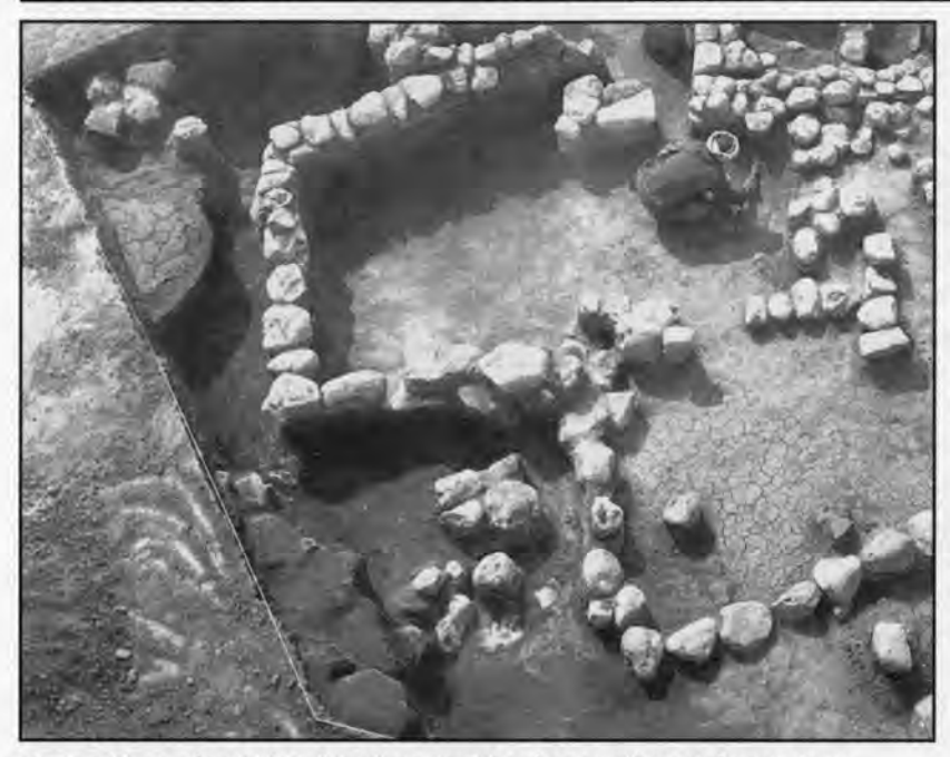
Jarmo. Operation II, level 2, Floor, South; view southwest from tower

bandits and dangerous wild animals, but I think now he will stop playing cowboy.