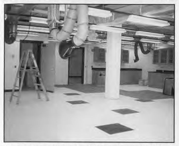
Figure 3. The western portion of the new Conservation Laboratory. The door on the left (behind the stepladder) leads into a special cleaning room. The other open doorway provides a glimpse of the adjacent library stack space.

time being, however, these high ceilings provide us with the possibility of adding a mezzanine to these spaces to increase storage capacity (especially important for the Archives, which are the only steadily growing part of the collections). The Con-