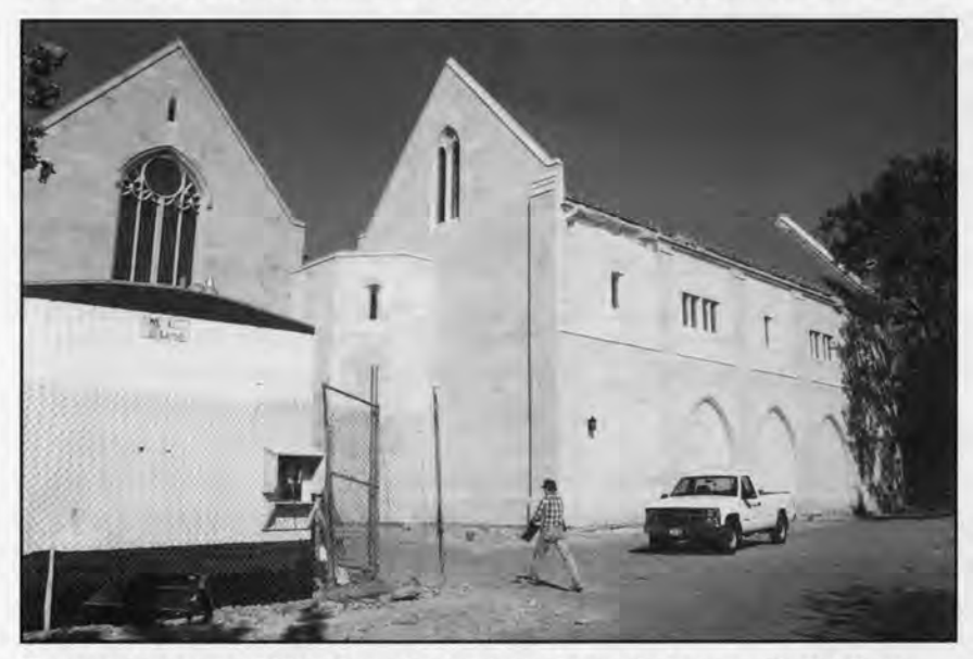
Figure 1. The new addition from the southwest. The first floor, with the three blind arches on the facade, will house archival and organic object storage. The second floor will contain the Conservation Laboratory on the east side and the library stacks on the west side. Access from the stacks into the Reading Room, whose rose window is visible in the photograph, is through the stair tower adjoining the two structures and partially lit by a small lancet window. The end windows of the third floor, which will contain Exhibit Preparation areas, echo the rose window of the Reading Room

Inside, the four air handling units that will provide climate control for the basement and first floor have been circulating air (successfully) for over a week, and the dehumidifiers and humidifiers associated with them have been started up. This means that, if all goes well, the equipment will soon