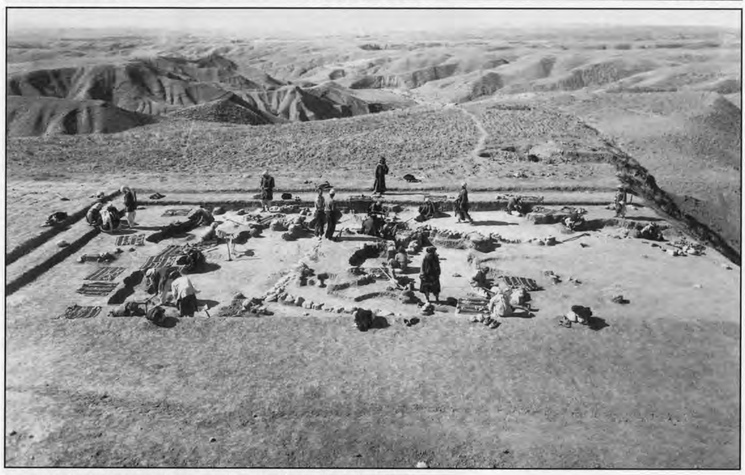
Jarmo, October 1950. Operation II - higher stone foundations of 1st level

situation will grow increasingly worse as the ground soaks up more and more rain. We've a lot of work to do in the house, however, and are pretty well stocked with absolute essentials, so we're not worried, and I rather gather the great outside world is not so overwhelmingly attractive at the moment that one minds being cut off from it.