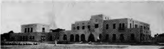
New "Chicago House" in Egypt on the east bank of the Nile in Luxor near Karnak Temple, with residence for staff, library, drafting room, offices, and photographic laboratory.

the new Oriental Institute building in Chicago, where original monuments and documents from the field were studied and displayed, and home research projects carried on.