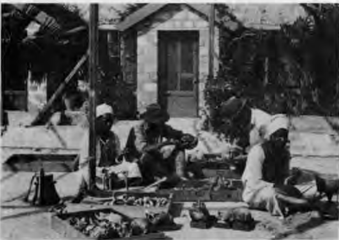
Workers at headquarters of the Palestine expedition in Megiddo.