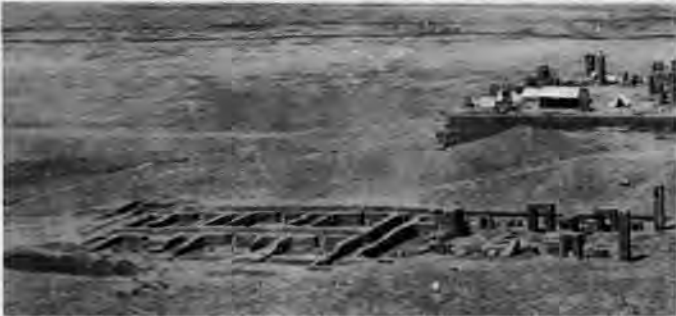
General view of harem palace of Darius and Xerxes in Persepolis. End (to the left) was restored for museum and expedition headquarters. the Persian cabinet granted the Institute a concession in 1930. The harem portion of Darius' palace was rehabilitated to serve as the expedition's headquarters during the period of the excavation and subsequently as a museum for the finer sculptures unearthed.

At the east end of the highland zone were the Persians, who were very late intruders into Elam, which had been of great importance to the Babylonians. High on a plateau among the Persian mountains, some 40 miles from Shiraz, stands Persepolis, the magnificent capital of the Persian emperors. Its chief founders were Darius and Xerxes, whom the Greeks fought at Marathon and Salamis in the early fifth century B.C. An anonymous source, new to the Institute, provided funds for the excavation and restoration of Persepolis after