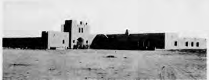
Headquarters of the Iraq expedition at Tell Asmar, some 12 miles east from the Diyala River, and 25 miles from Baghdad as the crow flies.

"With the museums of Europe stuffed for years with material that is not even unpacked, much of which can be utilized only by you and your personal staff—with this and other things you already have on hand, enough to keep you overwhelmed with work of the highest importance as long as you live—I cannot find it in my heart to approve anything that can divert you at all. . . . What yet lies under Eastern soil if fully disclosed