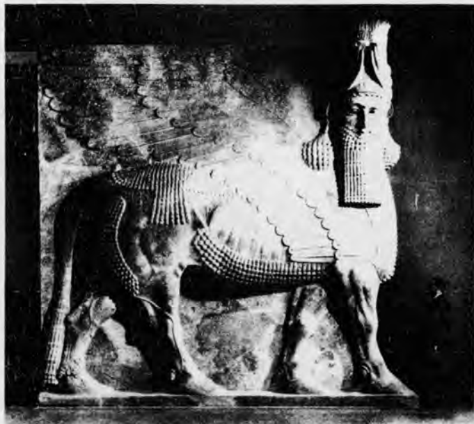
Dominating one end of the Oriental Institute Museum is colossal bull from Khorsabad, equipped with wings and human head, some 16 feet high and weighing 40 tons.

The commemorative year of the sixtieth anniversary of the Oriental Institute has been one of gala events, special lectures, symposia, and exhibits. The theme of October's News and Notes was "An institution is the lengthened shadow of a man", and dwelt on the highlights in the exciting life of James Henry Breasted, the enthusiastic and undaunted founder of the Institute. The theme was chosen because Breasted and the Institute cannot be separated. John D. Rockefeller, Jr., the benefactor who made much of Breasted's vision of far-flung outreach become reality, once said "I am really supporting an institution only because I believe in a man".