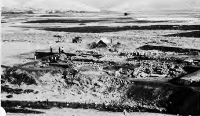
The main area of excavation, looking northward towards the Tauros mountain foothills. The "skull building" foundations lie at the right foreground; the plastered floor of the main room shows its protective white canvas covers.

The single surprise in this generally simple Sears Roebuck catalogue has, from the start, been the appearance of small articles