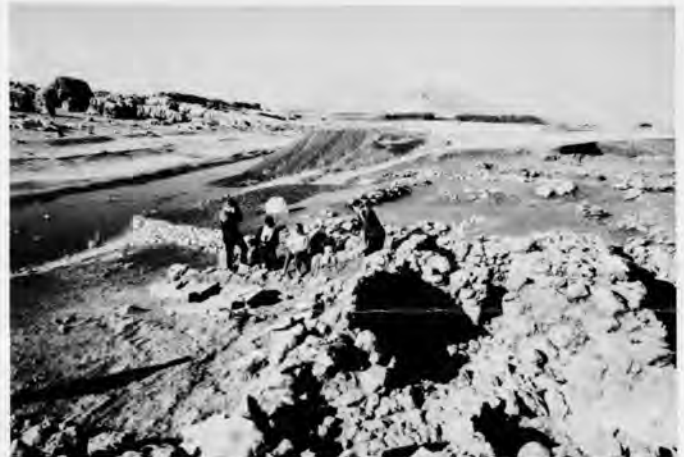
The building foundation remains of the Çayönü "skull building," looking westwards with the Boğaz Çay stream and the Hilar rocks on the right.

Next, in our third (1970) field season, we found the even larger and certainly grander single-roomed remains of a similar building, this time with a fine salmon-colored terrazzo floor, and with interior pilasters, their positions emphasized by pairs of white lines in the terrazzo flooring. In the northwest corner of the