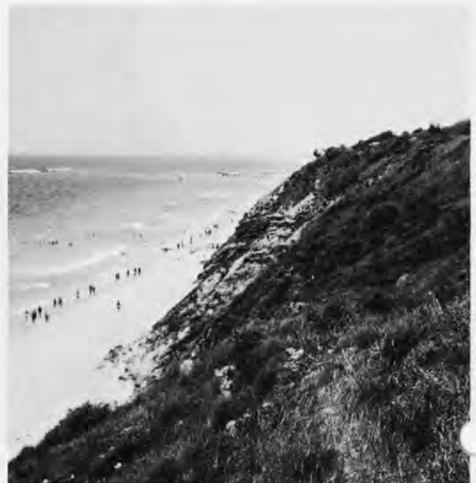
Tel Ashkelon rising above the beach and sea.