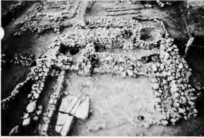
End-of-season plan view of the Çayönü "skull building" foundations. The round stone-lined pit in the right rear is an intrusive storage pit. The original wall-heights would have been of sun-dried brick, over the stone foundations.

and pigs provided the meat for most of the site's duration. Toward the end of the occupation, domesticated sheep (and probably goats) appeared.