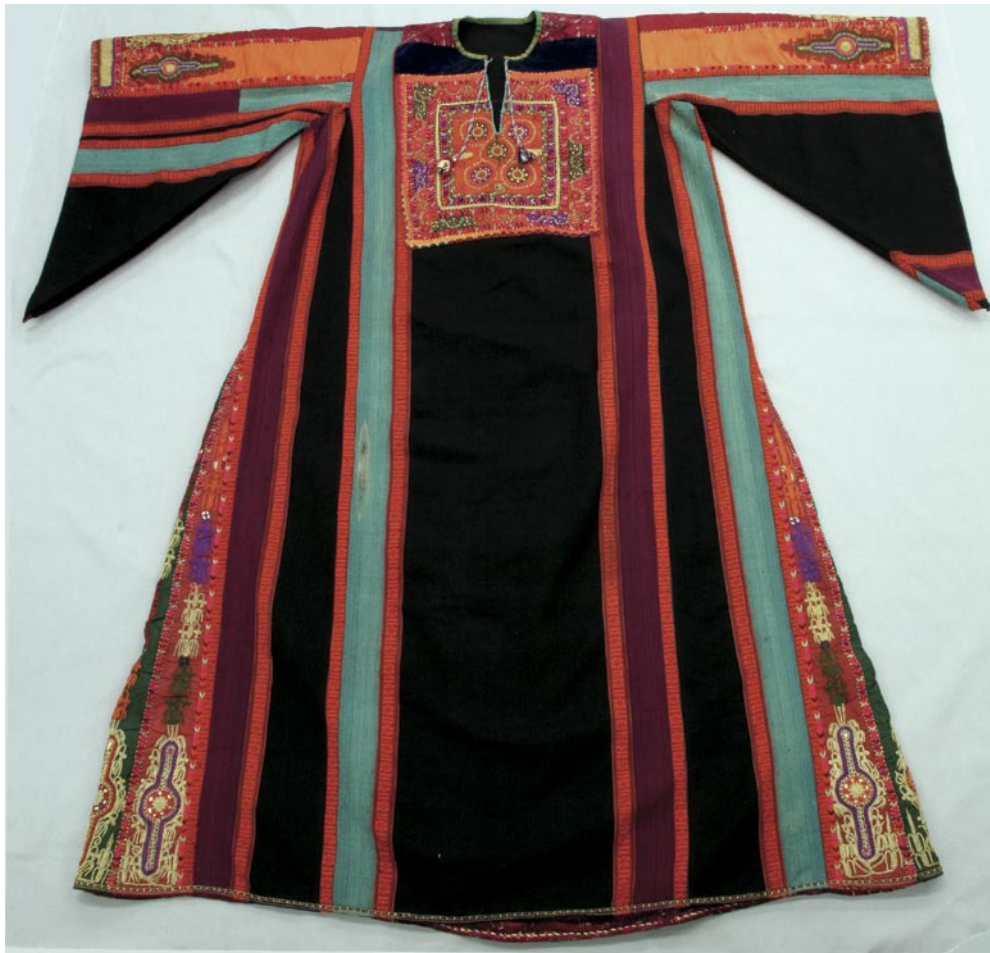
Thob al malak (bridal gown). The watch pattern ( sa'at ) is couched on the top of the sleeves and on the side panels ( benayiq ). The chest panel ( qabbah ) has a vase pattern surrounded by the sabal herringbone stitch. Bethlehem. OIM A35640A

The Bethlehem royal dress or thob al malak is one of the most distinctive dresses of Palestine. During the nineteenth and early twentieth centuries it became fashionable for women from all over Palestine to purchase the thob al malak . For women who could not afford the entire dress, the chest panel sufficed. The Bethlehem dress was unique and distinct, especially since it was embellished with gold and silver and silk threads. This beautiful