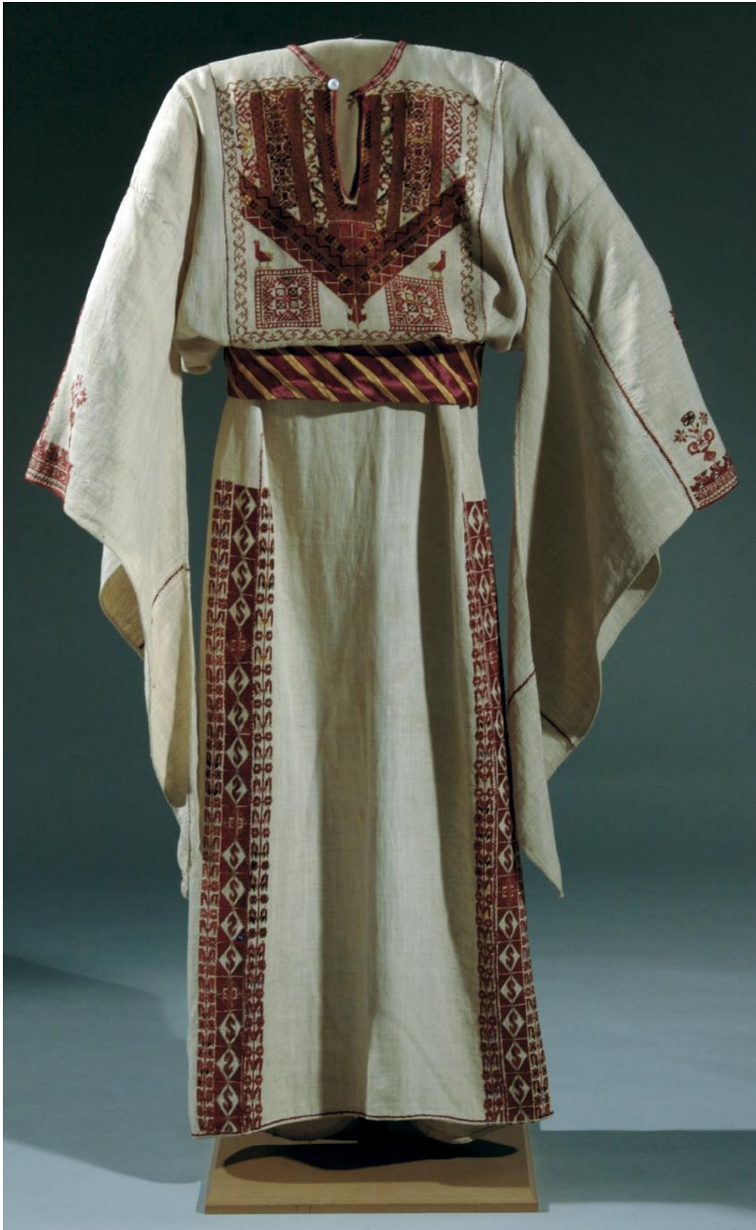
White rumi thob with atlas silk belt ( zunnar ). Ramallah. OIM A35635A