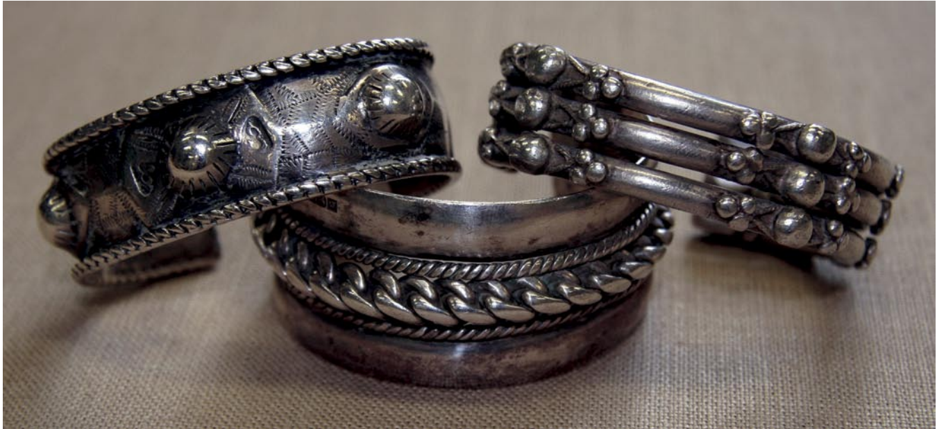
Group of silver bracelets. Left: haydery , middle: masriyeh , right: dumlug . PHC 149, 130, 155

The popular haydery bracelets were produced locally in Bethlehem, and they were worn by women from that town and the surrounding villages as far south as Hebron. These bracelets were produced by four or five different silversmiths who lived throughout Palestine. Some of these silversmiths are known to us today because they stamped their names on the front of the bracelets so their work could be instantly recognized. Most women wore these bracelets in pairs, one on each wrist, but some preferred wearing two per wrist. Some women mixed styles to demonstrate their wealth. In the 1920s, new designs of jewelry made of gold flooded the markets and women were drawn to the new styles, eventually abandoning the locally made silver jewelry.