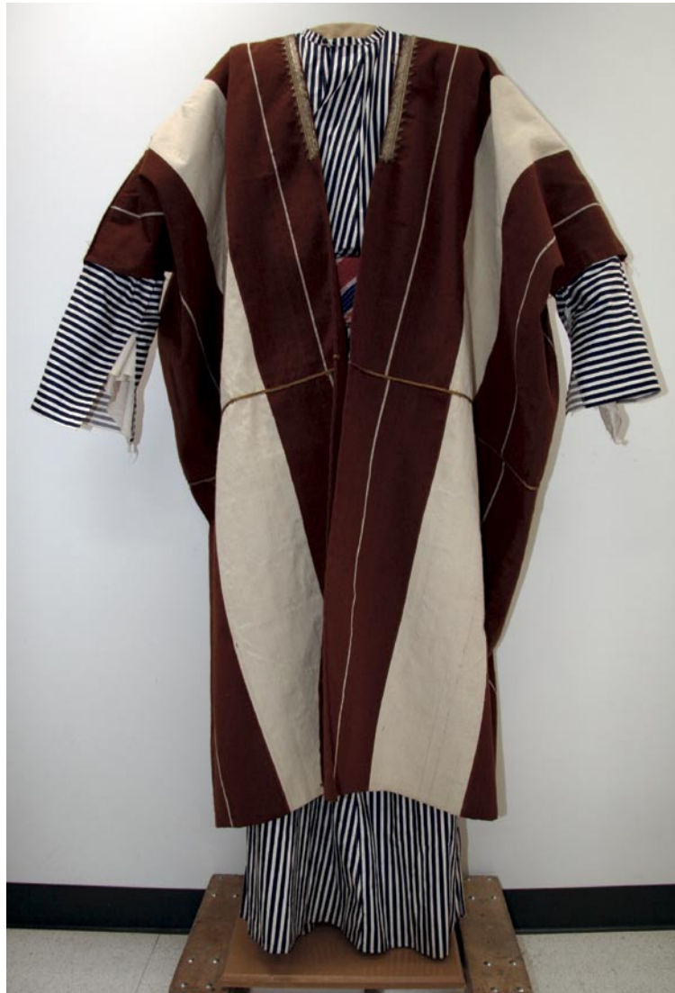
Wool cloak ( 'abaya ) worn over a striped coat ( qumbaz ). OIM A35660, A35648B

The long coat ( qumbaz ) was worn over the tunic. The qumbaz had narrow sleeves, a round neckline, and was usually ankle length. It was often made of cotton, but the more expensive examples were made of Syrian silk. Qumbaz fabric was usually striped in very colorful combinations; some were multi-colored while others were much simpler utilizing only one or two colors. The white and blue striped qumbaz was the preferred color combination in many Palestinian villages. It is believed that in the late nineteenth-early twentieth century the color of the qumbaz reflected certain village or group associations, and men proudly wore their village colors in public ceremonies or festivals.