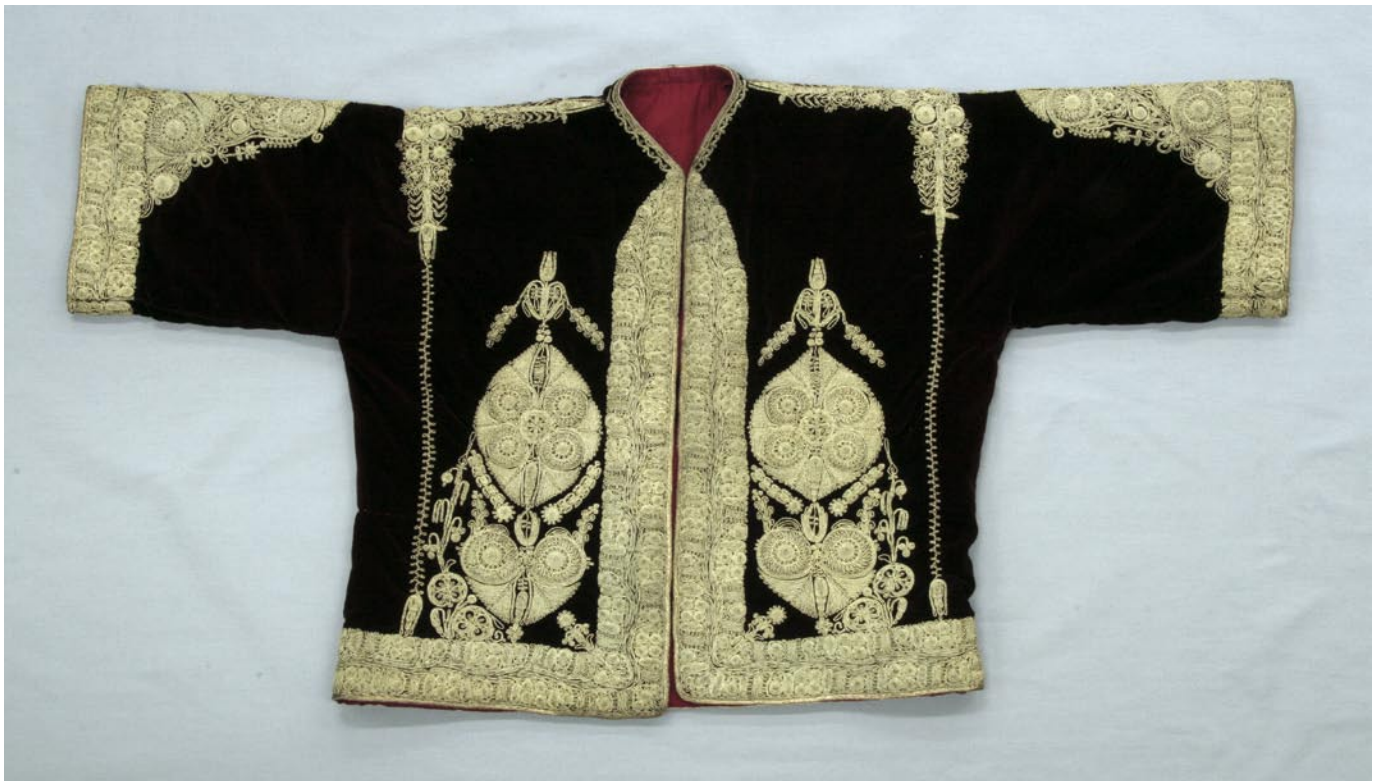
Velvet jacket ( taqsireh ) with gold couching decoration. Bethlehem. OIM A35652

The thob al malak is embroidered with the distinctive Bethlehem couching in silk, gold, and silver threads in circular and zigzag patterns. Couching in silk, which began in the nineteenth century, is known as tahriri , and the use of gold or silver cord, which started in the early twentieth century, was referred to as qasab . This decoration gave the Bethlehem embroidery style a unique appearance and made it very popular in other villages and towns throughout Palestine. Women from the Bethlehem region were often commissioned by residents from other towns and villages in Palestine to create the wedding day dress, or at least the chest panel. Along with Beit Jala and Beit Sahur, Bethlehem was a largely Christian community, so women were familiar with the elaborately decorated robes of the patriarchs and church furnishings, as well as with ornate Ottoman clothing. These influences probably contributed to the introduction of the couching technique in Palestine, especially the use of gold and silver threads.