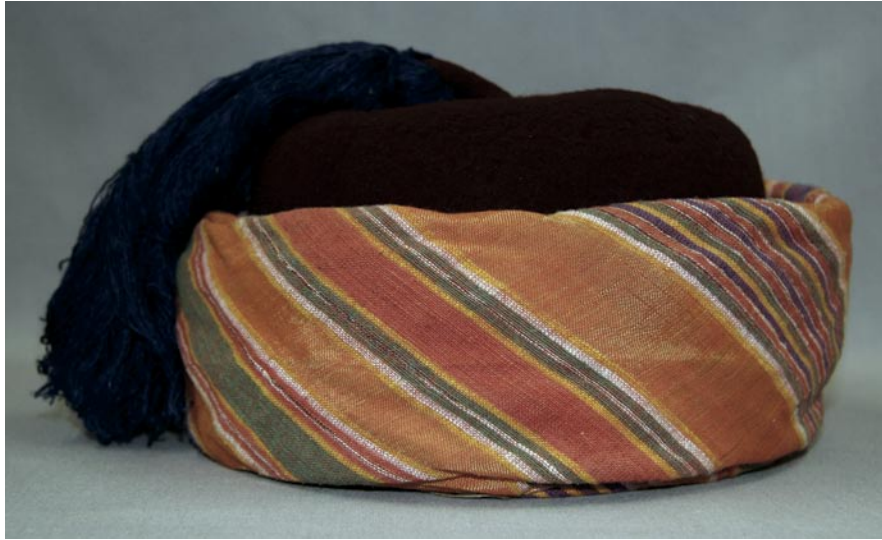
Man's head wear composed of a wool cap ( tarbush ) wrapped in a silk fabric ( laffeh ). OIM A35645E-F

The two main headdresses worn by Palestinian men were the tarbush and laffeh and the hata wi 'agal . The tarbush is the Ottoman-style flat-topped conical hat made of red or burgundy felt with a black tassel usually made of silk. It was worn by men in towns during the period of Ottoman rule in Palestine. The Turkish tarbush was high and stiff while the Palestinian tarbush was made of softer material and was shorter and flatter. Men would wrap a piece of cloth ( laffeh ) made of Syrian silk or cotton around the tarbush . The color of the laffeh indicated the age, social standing, and religious affiliation of the wearer. For example, a tarbush wrapped with ghabani fabric was worn by village elders, while a tarbush with orange laffeh was worn by both Christians and Muslims in various villages throughout Palestine. The tarbush and laffeh were worn only by adult men.