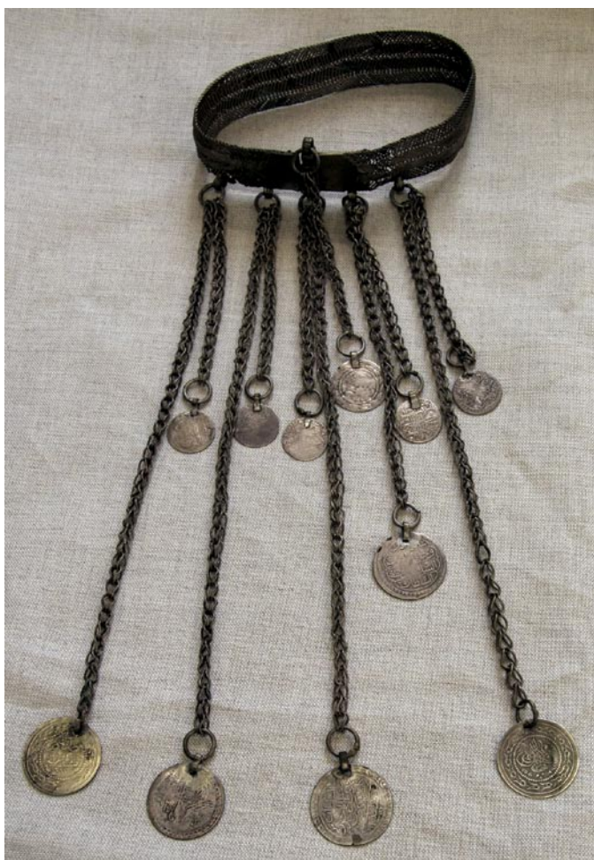
Silver choker ( bughmeh ) with chains ornamented with early nineteenth-century Ottoman coins. OIM A35638G

The iznaq was worn by married women in the Bethlehem area. This piece is made of a large silver chain that hung from the shatweh , the married woman's headdress. The iznaq could be double-chained and from it hung an additional seven chains ( sabe' erwah ) or five chains ( khamis erwah ). These chains were usually adorned with silver roses and at the lower end where all the chains met hung a Maria Theresa coin. Some Christian women substituted a cross for the Maria Theresa coin.