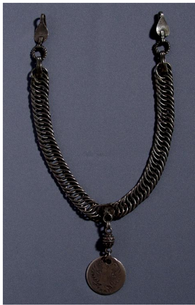
Silver chin-chain ( iznaq zarad ) that secured the saffeh headdress. The large Maria Theresa coin, originally minted in Austria, was widely accepted in parts of the Middle East until the mid-twentieth century. PHC 136