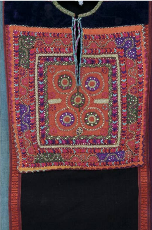
Chest panel ( qabbah ) embroidered with vase pattern (central area) surrounded by the chevron-shaped sabal border. Bethlehem. OIM A35640A

Color schemes were created in a manner that expressed a woman's feeling and stage in life. For example, in the Hebron region, older women wore dresses embroidered with purple threads whereas younger women and girls embroidered their dresses with red and green. In some Bedouin tribes, unmarried girls wore dresses embroidered on the back panel and the front panel with blue, while married women used the color red to signal their status as