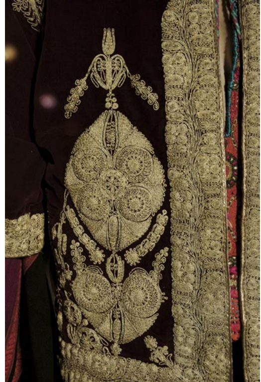
Gold cord embroidery (couching) in floral pattern on the front of a short jacket ( taqsireh ). Bethlehem. OIM A35652