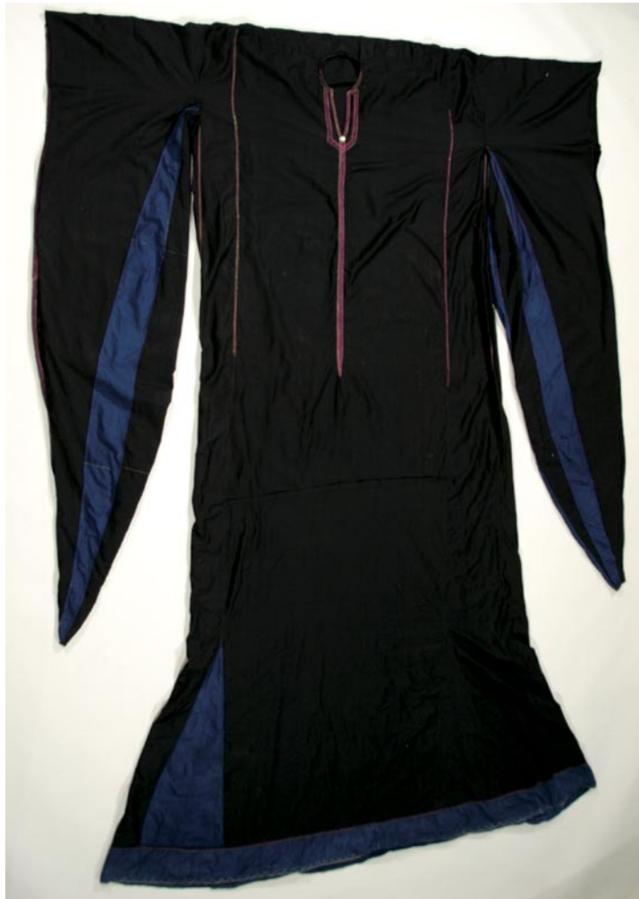
Long dress ( thob ) of Jericho. OIM A35636A

The sleeves of the Jericho thob are very long and pointed, a feature that facilitated carrying objects. When a woman needed to work, she would either tie the sleeves over her shoulders and behind her back or over her head with a headband ( 'asbeh ) or a patterned scarf.