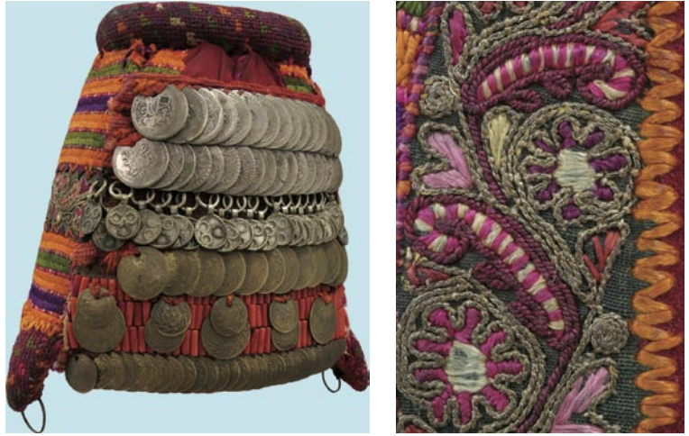
Shatweh (married woman’s headdress) adorned with bridewealth coins. Detail on right. Bethlehem. OIM A35640E

There are two kinds of bridal dresses in Bethlehem: the thob al malak and the thob al malak al ikdari . The dresses are similar except for the color of the fabric. The thob al malak is made of linen and silk with vertical stripes in varying shades of red. The linen fabric contains a high percentage of silk and required extensive labor and was therefore one of the most expensive fabrics in the region. The thob al malak al ikdari , which translates as “green royal dress,” is made of red, green, and indigo striped fabric. Like the thob al malak , the thob al malak al ikdari is made of fabric with a high percentage of silk and required extensive labor.