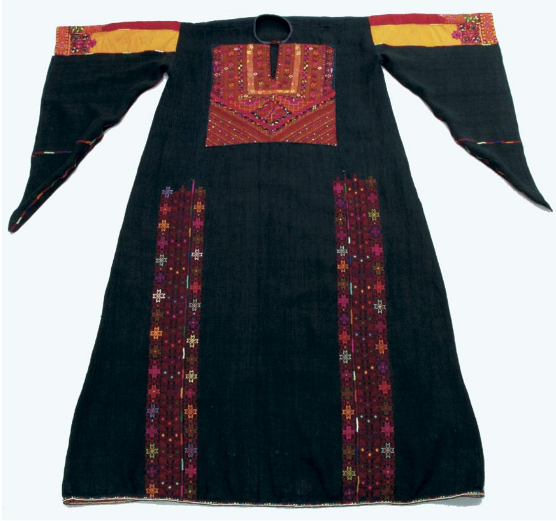
Black rumi thob with skirt and chest panel heavily embroidered in the eight-pointed star motif. Ramallah. OIM A35633A

was more popular in Ramallah during the late nineteenth–early twentieth century. Later, the irdan became more fashionable, especially for dresses worn on special occasions.