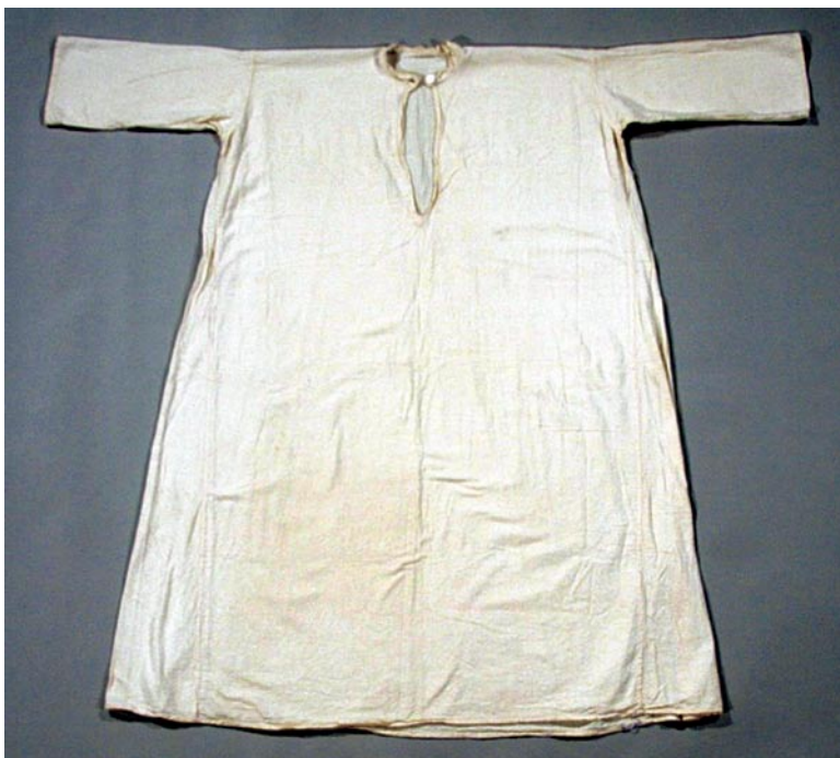
Man's tunic (qamis). OIM A35644A

Bedouin men would wear a 'abaya (overcoat or shoulder mantle) made of hand-woven wool that was usually brown and white. Other more modern 'abayas are made of a lighter material like fine wool or silk. These 'abayas were often worn by wealthier men, and to add to the beauty of their overcoat, most had their 'abayas embellished with a border of zigzag gold threads. During the cold winter months, instead of the 'abaya, village and Bedouin men alike preferred to wear a knee-high sheep skin coat known as the farwa . The farwa was worn with the woolly part of the skin toward the body, which kept the wearer very warm.