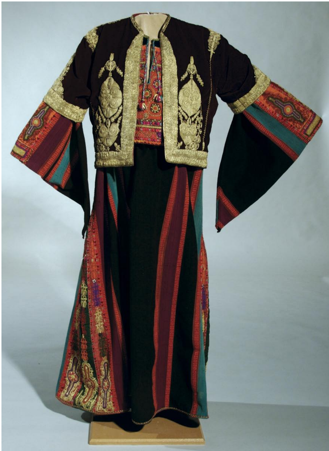
“Royal dress” ( thob al malak ) with short velvet jacket ( taqsireh ). Bethlehem. OIM A35640A, A35652