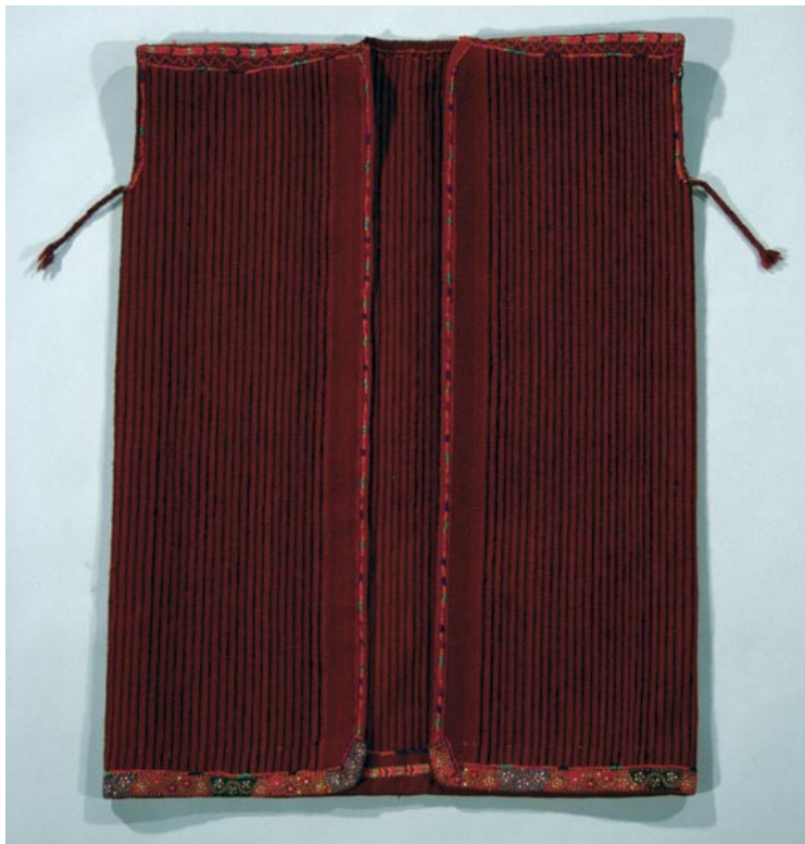
Sleeveless striped wool cloak ( bisht ). Bethlehem. OIM A35646B

cuffs. Over time, the taqsireh became more intricate with elaborate gold and silver couching done on velvet instead of broadcloth.