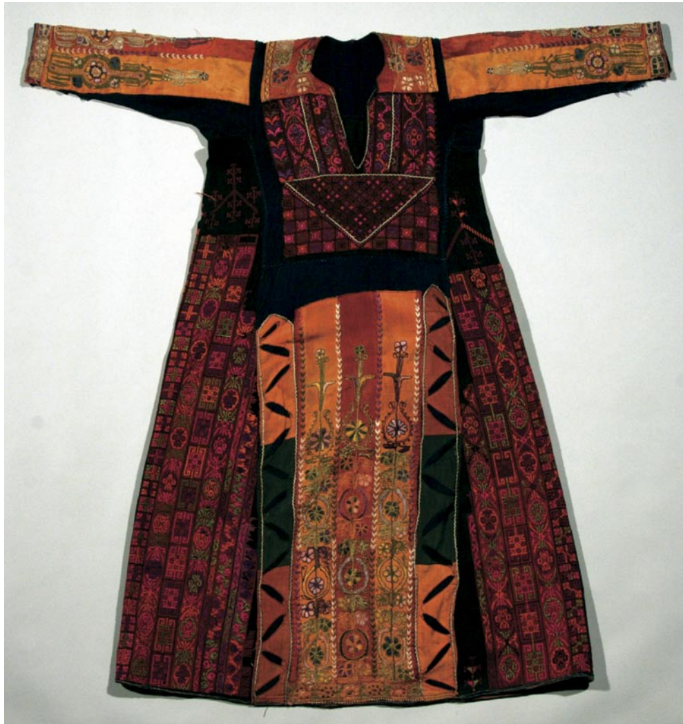
Wedding dress ( jallayeh ) of the Hebron area. PHC 170

Another head veil used in Hebron was called the ghudfeh . This head veil was made of cream-colored linen and was embroidered with beautiful multi-color thread with designs similar to those found on the dress.