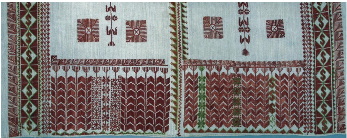
Linen shawl ( khirkah ) embroidered with S-shaped “leech” (left and right borders), tall palms (center), eight-pointed star (left center), and feathers (left and right edges and above palms) patterns in silk thread. Ramallah. OIM A35635B

The two traditional colors of fabrics used for Palestinian dresses were un-dyed linen and indigo blue, the favorite color of most villages and Bedouin. White linen or cotton fabrics were favored and used in some villages like Ramallah and Beit Dajan.