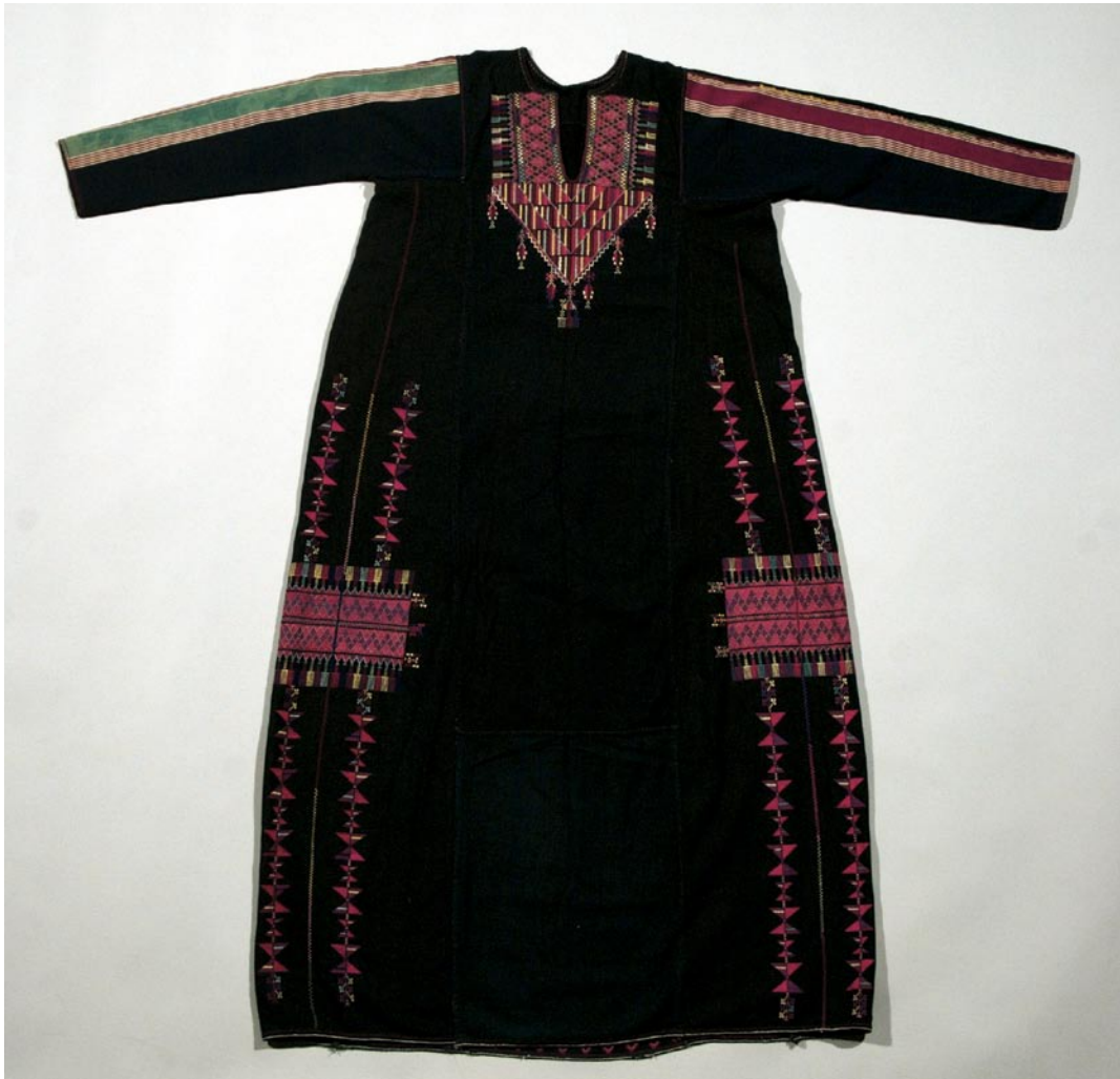
Abu Mitain thob with triangular chest panel. The side panels are embroidered with amulet motifs. Gaza. PHC 165

The dresses that originate from the area around the port city of Gaza are made of cotton and silk fabric woven in the town of Mejdal on a traditional loom ( nol ). The fabric was woven in strips ( maqta' ) in a specific size: 33 centimeters in width and 7 meters in length. These strips were then connected to one another using the manajel stitch. The fabric of the Gaza thob was given various names based on its fabric, design, and color. Abu Mitain is indigo blue cotton with wide magenta strips and smaller red and green strips on each side of the dress. The Abu Mitain dress – also the name of the fabric – lacks embroidery although sometimes a small embroidered amulet is sewn at the bottom of the neck opening.