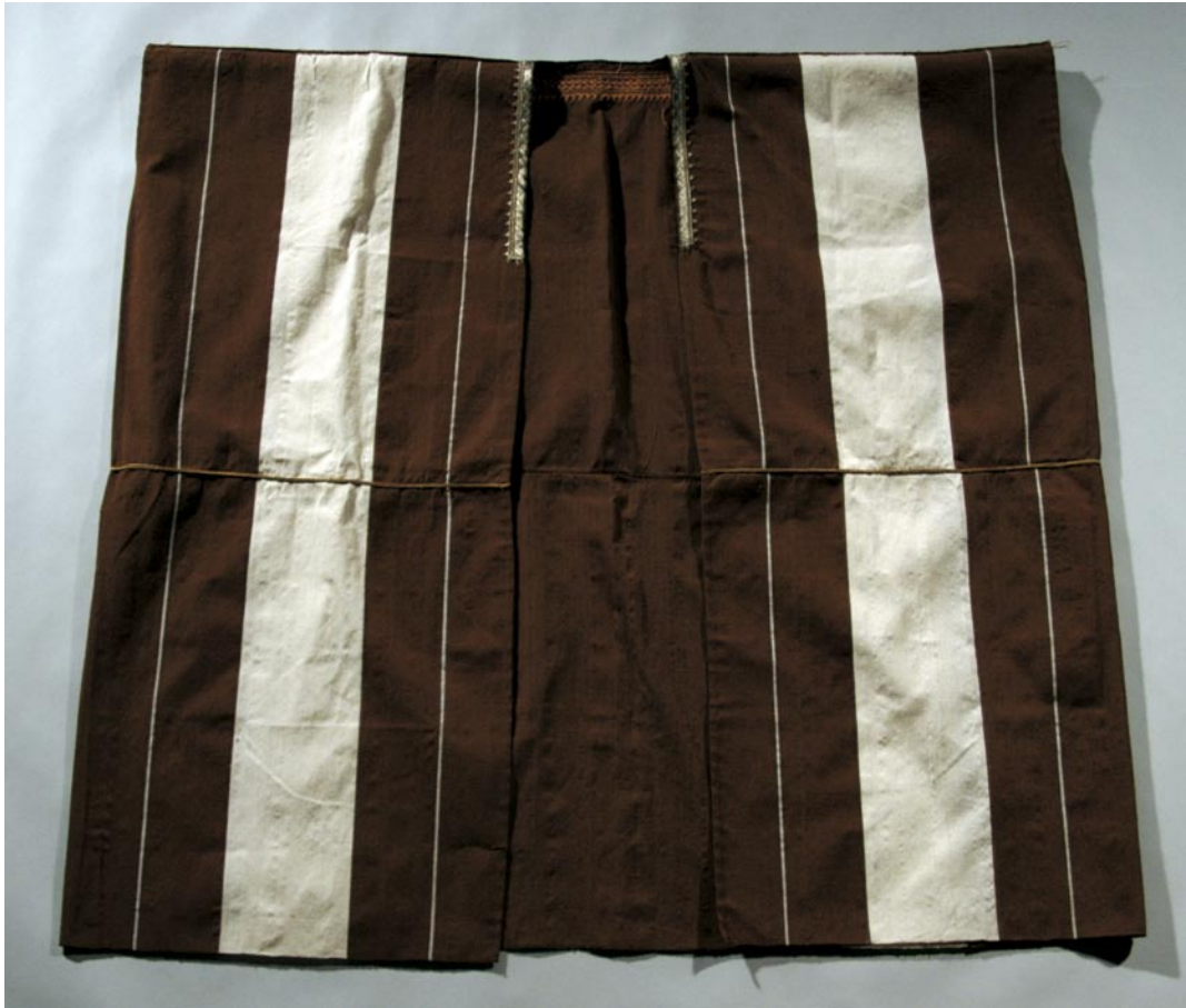
Man's overcoat ('abaya) of striped wool with metallic couching on the neck. OIM A35660