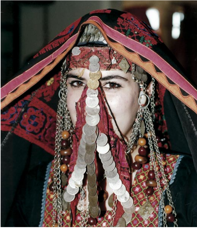
Bedouin face veil ( burqa' ) embellished with coins. PHC 151.

the back panel of her dark blue cotton cross-stitch embroidery with a few colored motifs indicating that she was seeking to remarry. Some women in this region embroidered motifs of little children on their dresses if they were interested in having children of their own. The importance of the decoration of the back panel in many regions is due to a conservative moral code. It was not considered proper to look at a woman's face or to stare at her from the front. However, watching her from behind as she passed by was considered more acceptable.