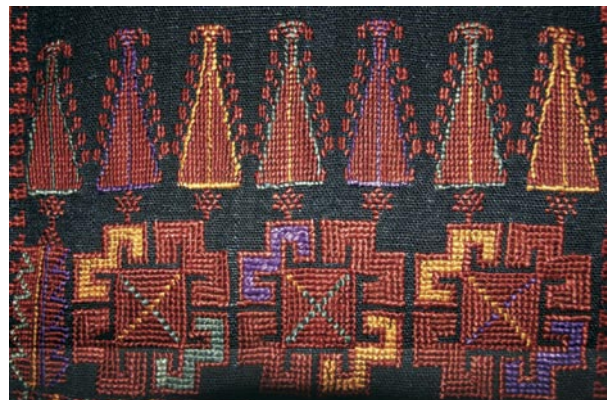
“Cypress tree” (top) and Pasha’s tent (bottom) motifs. Jaffa-Beit Dajan. OIM 35643A

Embroidered motifs could express a woman’s hopes and expectations, and even her attitude toward certain issues such as marriage, children, and in-laws. If a woman from Hebron, for example, wanted to have children, she might embroider “doll” figures on the back panel of her dress to express this desire. In social gatherings with other women from adjacent villages or towns, women had no need to ask where the other women came from, for their places of origin were apparent in the dresses they wore. For example, women from Beit Dajan often embroidered an orange blossom on their dresses, for this village was known for its orange orchards. Cypress trees embroidered between the orange blossom motifs symbolized the boundary between the orange orchards. A careful observer, however, would be able to recognize if a woman wearing an orange blossom dress advertising her residence in Beit Dajan was originally from a different village by taking note of motifs and stitches that were not typical of Beit Dajan.