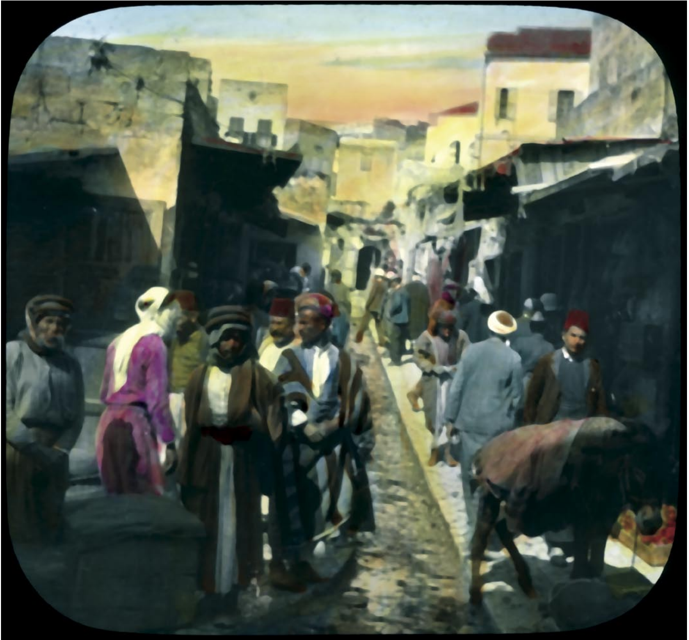
Jerusalem street scene. Pre-1914.