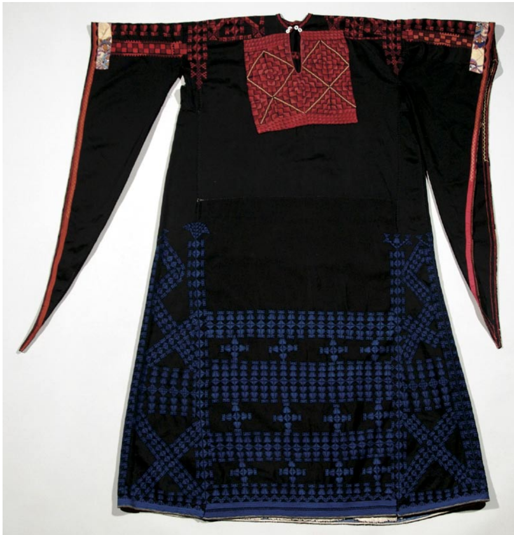
Dark blue sateen thob . Bir Sabe'. PHC 150

Women of the semi-desert area used the lower back panel of the dress for self-expression and as a way of non-verbally communicating their desires and aspirations. A woman's identity was expressed mainly by the colors and designs used: blue threads for the young and for widows and red for married women. A widow would decorate