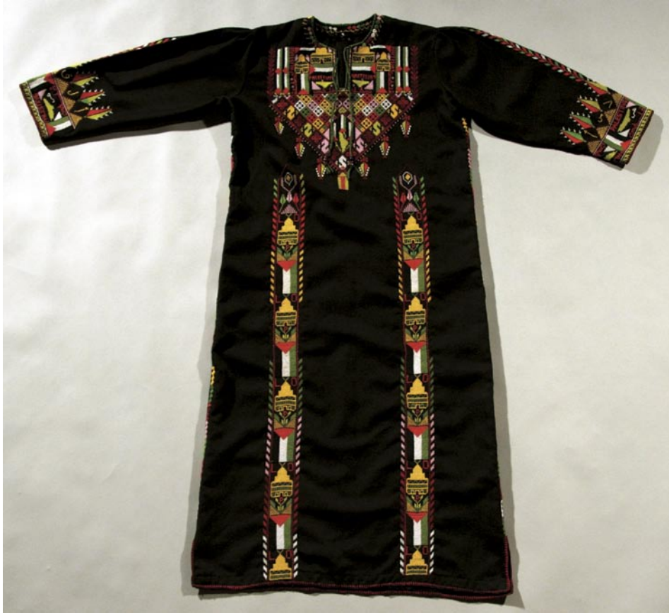
Modern dress ( thob ) decorated with Palestinian flags, images of the Dome of the Rock, and the word “Palestine.” PHC 173

basic structure and characteristics of pre-1948 dresses, but they were much simpler in style and decoration, and hence were less costly and time-consuming to produce.